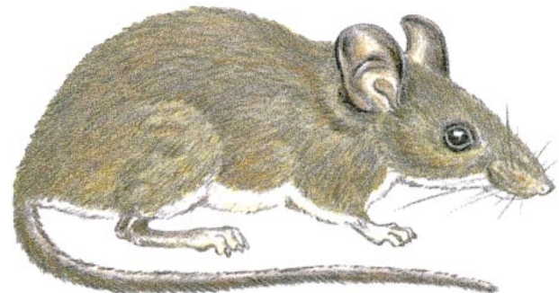
FIG. 1. Drawing of Peromyscus hooperi adult male (Centro de Investigaciones Biológicas del Noroeste, number 4482).

Newborns are slightly pigmented except on venter, legs, elbows, thighs, ankles, and feet. By day 2, young begin to grip teats more strongly and faint hairs appear on head and dorsum. Between days 3 and 4, dorsal pigmentation is darker, epidermal scales are evident, and pinnae become erect. On day 5, feeble locomotory capacity develops. On day 7, lower incisors have erupted and ventral hairs are visible. On day 9, upper incisors have erupted. After day 13, eyes have opened and external auditory meatus is patent. Postjuvenile molt occurs between 35 and 40 days of age. Dorsal post-subadult molt occurs between 10 and 20 weeks of age and lasts 5 weeks. The winter coat, which is typically gray, occurs before December and the brownish summer molt occurs between March and May (Schmidly et al. 1985).