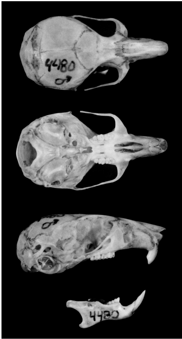
FIG. 2. Dorsal, ventral, and lateral views of cranium and lateral view of mandible of Peromyscus hooperi (adult male, Centro de Investigaciones Biológicas del Noroeste, number 4480). Greatest length of cranium is 24.43 mm.

ECOLOGY. Optimal habitat for P. hooperi is the grassland transition floral zone (Schmidly et al. 1985). This vegetation type separates the Chihuahuan desert scrub below and Montane Chaparral above. Conspicuous plants are Dasyllirion , Nolina , and Yucca , interspersed with various grasses (Lee and Schmidly 1977). P. hooperi occurs in different habitats in Coahuila and N of Zacatecas—a mixture of desert scrub and grassland transition vegetation that is dominated by Bouteloua , Dasyllirion , Nolina , and Yucca carnerosana (Schmidly et al. 1985). Trapping success was better on the slopes than in the arroyo, and a greater number of specimens were collected in the grassland transition vegetation (dominated by Acacia constricta , Agave scabra , Aristida , Berberis , Ephedra , Euphorbia antisiphilitica , Forestiera , Hectia , Parthenium incanum , and Rhus varians ).