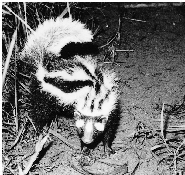
FIG. 1. Adult Ictonyx striatus .

In South Africa, measurements (in mm) of 35 males and 14 females average ( \pm SD ), respectively: length of head and body, 338.5 \pm 25.6, 308.3 \pm 27.5; and length of tail, 249 \pm 29, 250 \pm 29 (Roberts 1951). Average (in mm; range in parentheses) of 3 males and 3 females, respectively, from KwaZulu-Natal (Rowe-Rowe 1978a) were: length of head and body, 365 (350–380), 331 (320–340); length of tail, 205 (165–245), 206 (199–210); length of hind foot, 55 (50–59), 54 (50–59); and length of ear, 27 (25–30), 27 (26–29). The same measurements (in mm; range and sample