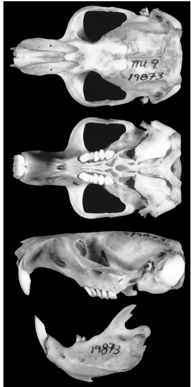
FIG. 2. Dorsal, ventral, and lateral views of cranium and lateral view of mandible of Geomys knoxjonesi (female, Museum of Texas Tech University, TTU 19873). Greatest length of skull is 38.4 mm.