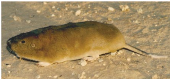
FIG. 1. Live Geomys knoxjonesi .

Average and extreme cranial measurements (in mm) from 24 male and 39 female pocket gophers, respectively, are: greatest