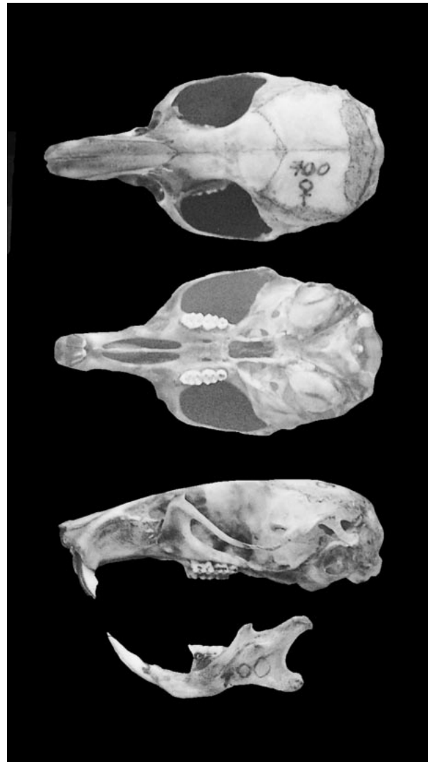
FIG. 2. Dorsal, ventral, and lateral views of cranium and lateral view of mandible of Peromyscus sejugis (adult male from Isla Santa Cruz, Baja California Sur, México, in the mammal collection of the Centro de Investigaciones Biológicas del Noroeste, number 700). Greatest length of cranium is 27.14 mm.