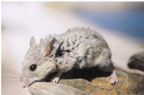
FIG. 1. Specimen of Peromyscus sejugis of Isla San Diego, Baja California Sur, Mexico.

FORM AND FUNCTION. Average size of the testis of the males ( n = 23 ) is 7.3 mm (6.0–12.0 mm). The phallus of P. sejugis