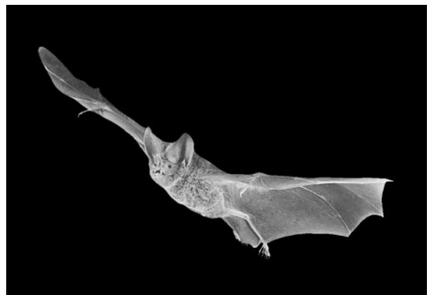
FIG. 1. Photograph of Trachops cirrhosus from Finca La Selva, Heredia Province, Costa Rica.