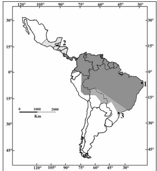
FIG. 3. Geographic distribution of Trachops cirrhosus . Sub-species ranges are indicated by numbers: 1, T. c. cirrhosus ; 2, T. c. coffini ; 3, T. c. ehrhardti . Type localities for each subspecies are indicated by black circles.

DISTRIBUTION. Trachops cirrhosus occurs from southern Mexico (Oaxaca), to the Guianas, as well as in parts of Brazil, Bolivia, Ecuador, and Trinidad (Fig. 3—Koopman 1993). T. c. cir-