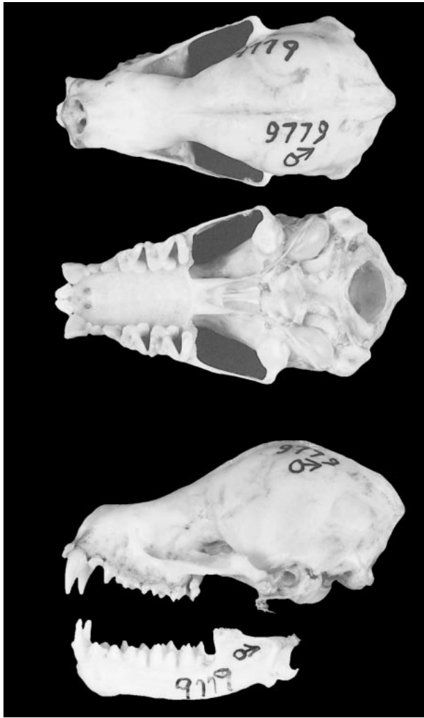
FIG. 2. Dorsal, ventral, and lateral views of cranium and lateral 4 view of mandible of an adult male Trachops cirrhosus (TTU [Texas Tech University] 9779) from Blanchisseuse, Trinidad. Greatest length of skull is 30.05 mm.

11.1–11.9; greatest length of mandible, 18.3–19.2; length of mandibular tooththrow, 9.9–10.1 (Mexico, n = 3 —Alvarez-Castañeda and Alvarez 1991); length of maxillary tooththrow, 9.7–10.3; breadth across upper canines, 5.7–5.8 (Mexico, n = 3 —Alvarez-Castañeda and Alvarez 1991); and breadth across upper molars, 9.3–10.0. Selected external and cranial morphometric characters (in mm; mean \pm SD for T. c. ehrhardti (Brazil, n = 3 unless otherwise specified—Carter and Dolan 1978) are: length of ear ( n = 1 ), 31; length of forearm, 58.5 \pm 2.0 ; length of tibia, 23.2 \pm 0.5 ; greatest length of skull, 28.0 \pm 0.5 ; condylobasal length, 24.8 \pm 0.4 ; zygomatic breadth, 13.8 \pm 0.4 ; mastoidal breadth, 13.1 \pm 0.3 ; width of postorbital constriction, 5.0 \pm 0.1 ; breadth of braincase, 11.4 \pm 0.1 ; depth of braincase, 13.4 \pm 0.1 ; greatest length of mandible ( n = 2 ), 17.6 \pm 0.5 ; length of mandibular tooththrow, 10.8 \pm 0.2 ; length of maxillary tooththrow, 10.1 \pm 0.2 ; breadth across upper canines, 5.7 \pm 0.2 ; and breadth across upper molars, 9.7 \pm 0.1 .