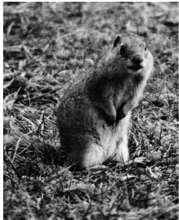
FIG. 1. Spermophilus armatus in the Lamar Valley, Yellowstone National Park.

Metabolic rates ranged from 137 to 177 ml O 2 /h when animals were maintained at 30°C (Hudson et al., 1972). Metabolism in-