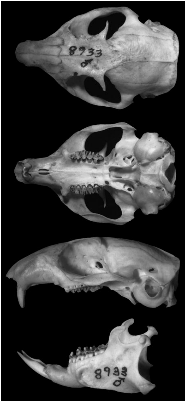
FIG. 2. Dorsal, ventral, and lateral views of cranium and lateral view of skull of Spermophilus armatus from 1 mile west of Alta, Salt Lake County, Utah (male, Utah Museum of Natural History, University of Utah UU8933). Greatest length of cranium is 49.3 mm.

creased to 500–570 ml O 2 /h when animals were maintained below thermal neutrality at about 10°C.