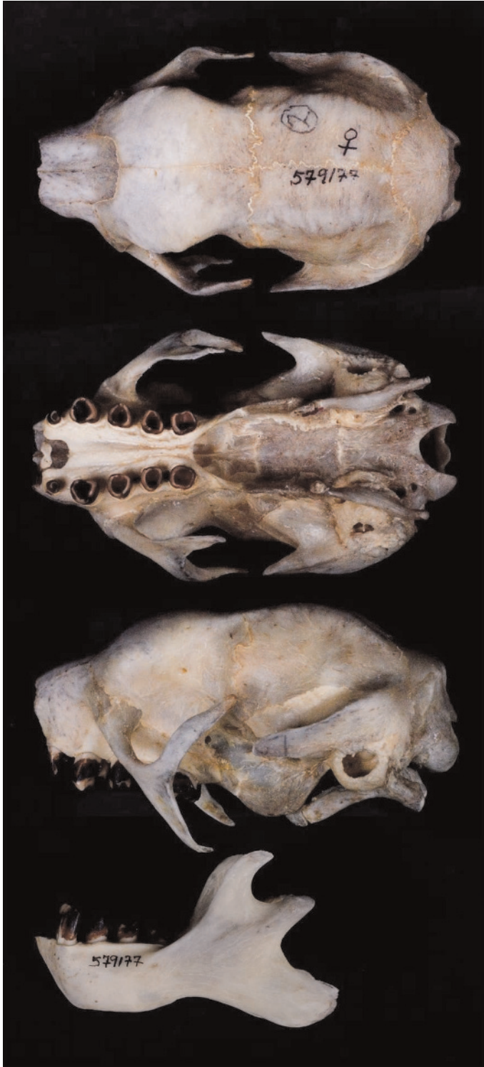
Fig. 2.—Dorsal, ventral, and lateral views of cranium and lateral view of mandible of an adult female Bradypus pygmaeus (United States National Museum 579177; age class 2 of Anderson and Handley [2001]). Greatest length of cranium is 68.7 mm.