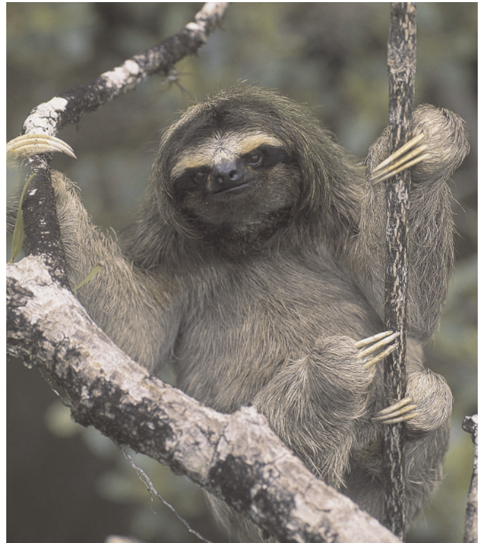
Fig. 1. —An adult Bradypus pygmaeus from Isla Escudo de Veraguas.

as extant two-toed sloths ( Choloepus ) based on craniodental characters (Gaudin 2004). This generic synonymy is modified from Gardner (2007). The following key to the 4 species of Bradypus is from Wetzel (1985) with modifications from Anderson and Handley (2001):