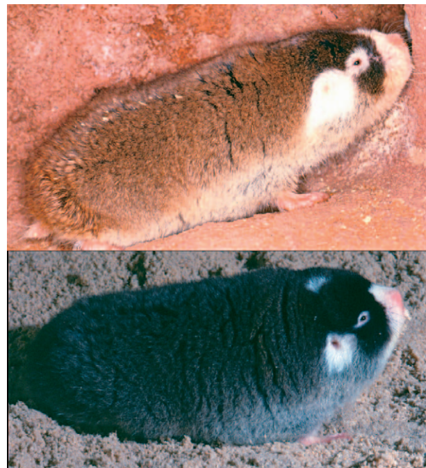
FIG. 1. Two color phases of the Cape mole-rat ( Georychus capensis ) from Cape Town.

FORM AND FUNCTION. Dental formula is i\ 1/1, c\ 0/0, p\ 1/1, m\ 3/3 , total 20 (De Graaff 1964; Taylor et al. 1985). Incisors of the Cape mole-rat grow continuously. In the wild, incisors are worn down as the animals dig by chiseling through the soil to excavate tunnels. Teeth of captive animals are honed or sharpened.