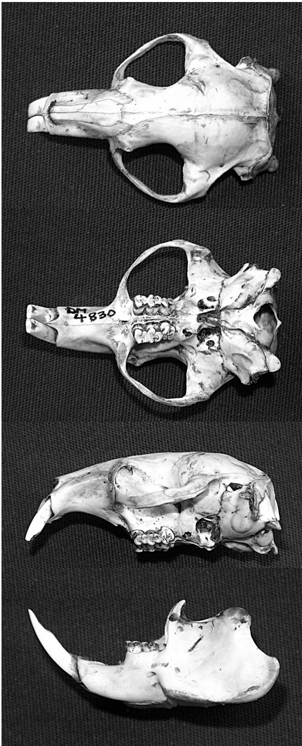
FIG. 2. Dorsal, ventral, and lateral views of cranium and lateral view of mandible of an adult male Georychus capensis from Impendle, KwaZulu Natal (30°40'S, 29°57'E; Durban Natural Science Museum, DM 4830). Greatest length of cranium is 44.0 mm.

When doing so, the Cape mole-rat braces itself with its forepaws and adopts a tooth-sharpening posture. Forward and backward and side-to-side actions of the lower jaw file upper and lower incisors against each other. Short forward thrusts of lower incisor against upper ones sharpen upper incisors. During the process flakes of chipped incisor are periodically flicked out of the mouth by the tongue. When jaws are fully open during digging, stiff oral bristles push soil particles aside and restrict soil entering buccal cavity.