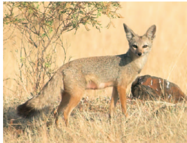
FIG. 1. Adult female Vulpes bengalensis , Nanaj, Maharashtra, India, February 2006.

FOSSIL RECORD. Prototocyon (= Sivacyon —McKenna and Bell 1997) curvipalatus , the type comprised of an associated