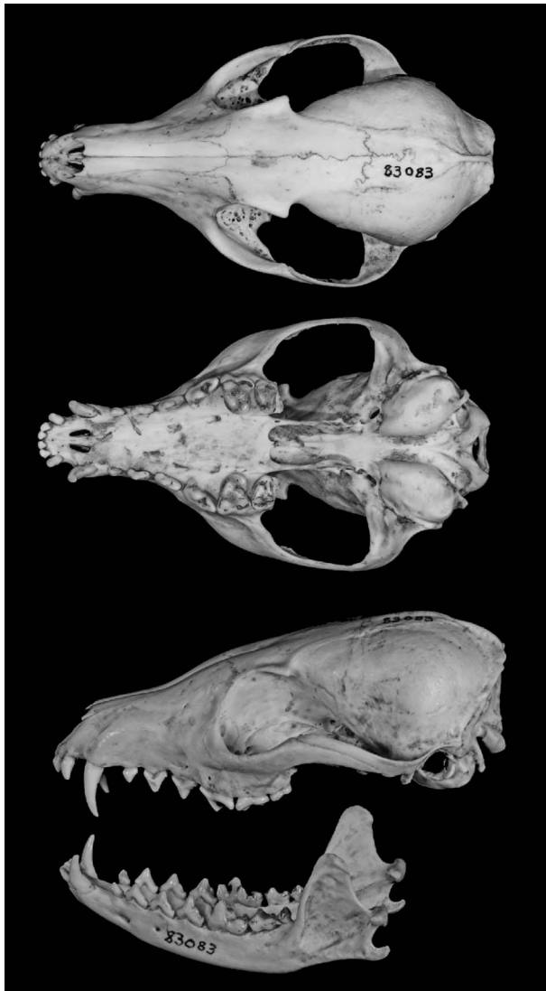
FIG. 2. Dorsal, ventral, and lateral views of cranium and lateral view of mandible of adult female Vulpes bengalensis (Field Museum of Natural History, Chicago, Illinois, 83083). Greatest length of cranium is 110.7 mm.

skull and mandible, was 1st described as Canis (= Vulpes ) curvipalatus and is considered closely allied to V. bengalensis (Bose 1880). The remains were recovered from the early Pleistocene Upper Siwaliks horizon of the Siwalik Hills, India (Colbert 1935; Pilgrim 1932).