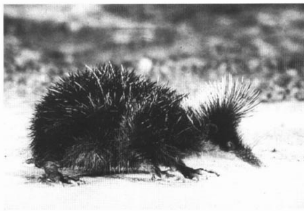
FIG. 1. Photograph of captive H. s. semispinosus at National Zoological Park (JFE).

The skull is elongated (Fig. 3), tapering anteriorly, and lacks a prominent sagittal crest. The dental formula is i\ 3/3, c\ 1/1, p\ 3/3, m\ 3/3 , total 40. Teeth show a reduction in size compared to other genera of Tenrecidae (Eisenberg and Gould, 1970; Mivart, 1871). There are 20-21 lumbar vertebrae and the pubic symphysis is widely open in some individuals, presumably females (Mivart,