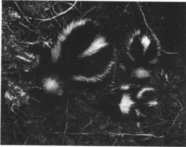
FIG. 2. Photograph of wild H. s. nigriceps in Madagascar.

1871). The urogenital and excretory systems exit the body through a common cloaca (Gould and Eisenberg, 1966).