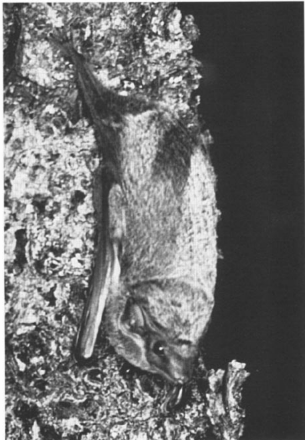
FIG. 2. Taphozous mauritanus , roosting on a tree trunk in Kruger National Park, South Africa. The white ventral surface is camouflaged while the bat roosts.

length of foot, 12; total length of tail, 19; length of free tail, 9; length of first digit, 11; length of second digit, 51; length of third digit (metacarpal), 54; length of third digit (phalanx I), 19; length of third digit (phalanx II), 23; length of fourth digit (metacarpal), 42; length of fourth digit (phalanx I), 11.5; length of fourth digit (phalanx II), 7.5; length of fifth digit (metacarpal), 33; length of fifth digit (phalanx I), 12; and length of fifth digit (phalanx II), 9. Other measurements are: wingspan: 181–204; length of head, 24.5–26.5; length of tragus, 5–7 (Happold et al., 1987). Body mass ranges (in g) for East Africa are: 20–25 (Kingdon, 1974); for Transvaal, 26–32 (males), 31–32 (females—Rautenbach, 1982); for Zimbabwe, 20–36 (11 males), 27.5–31.6 (7 females—Smithers and Wilson, 1979); and for Malawi, 20–29 (Happold et al., 1987).