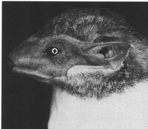
FIG. 1. Taphozous mauritanus , in Kruger National Park, South Africa. In profile, the white ventral surface is visible.