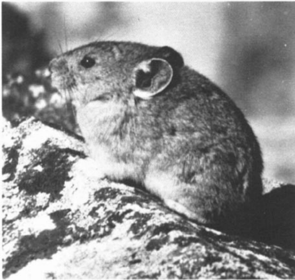
FIG. 1. Adult Ochotona princeps from Gunnison County, Colorado.

GENERAL CHARACTERS. Overall body form of O. princeps is typical of that of ochotonids: small, short-legged, apparently tailless, and egg-shaped (Fig. 1). Actually, pikas have a "buried" tail that is longer relative to length of body than any other lagomorph. Moderately large suborbicular ears are haired on both surfaces and normally dark in color with white margins. The digitigrade hind limbs are not appreciably longer than the forelimbs, and the hind feet are relatively short among lagomorphs. Soles of the feet are densely furred except for small black naked pads at the end of the toes (Severaid, 1955). There are five toes in front and four behind.