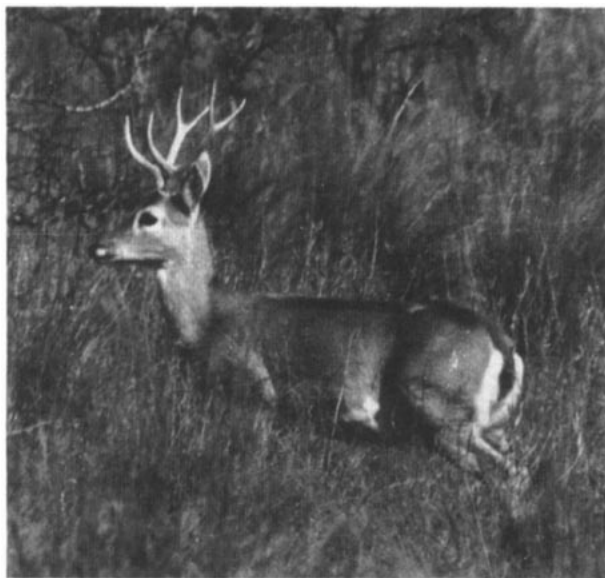
FIG. 1. Adult male pampas deer ( Ozotoceros bezoarticus celer ) in central San Luis Province, Argentina.

The original range of O. b. leucogaster comprised southwestern Brazil (southern Matto Grosso), southeastern Bolivia, Paraguay, and northern Argentina (northern Santiago del Estero, Santa Fé, Formosa, and Corrientes) but not east of the Río Uruguay. Population