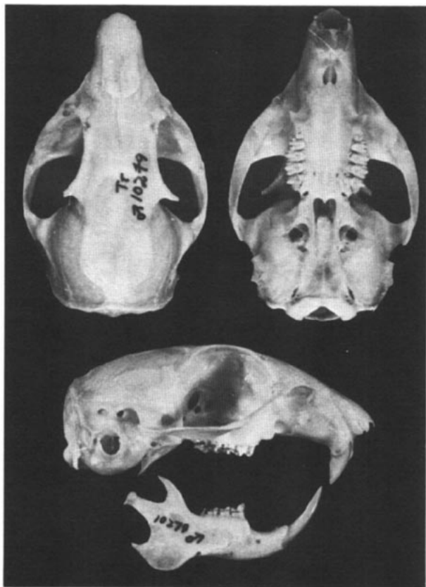
FIGURE 2. Dorsal, ventral, and lateral views of cranium, and lateral view of lower jaw of Spermophilus mexicanus parvidens (TTU 10279, male) from 15 mi. SW Roscoe, Nolan Co., Texas.

(1944) noted that "as early as June 28 numerous half-grown young were observed at the Monte Río Frio locality suggesting that the breeding season there does not differ materially from that of the subspecies ( parvidens ) occurring in Texas." These squirrels seem to maintain constant pairs during the breeding period; the length of gestation is not known, although it probably is about 30 days (Davis, 1974). Edwards (1946) noted that males have descended testes from the end of March until mid-May. He recorded a pregnant female as early as 4 April, although parturition does not occur until May.