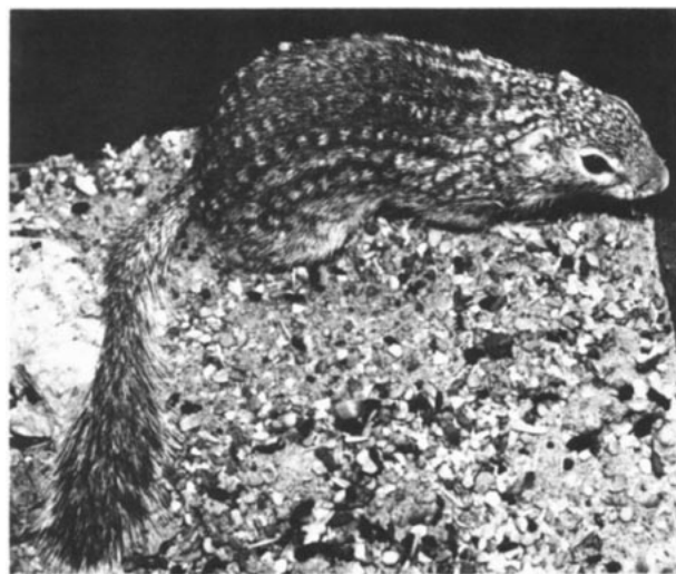
FIGURE 1. Photograph of Mexican ground squirrel ( Spermophilus mexicanus parvidens ) from Winkler County, Texas.