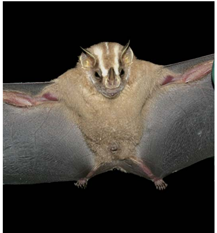
Fig. 1. —An adult female of Platyrrhinus recifinus collected from Sitio Sinimbu, Guarimiranga, Ceará, Brazil.

Platyrrhinus recifinus (Fig. 1) is medium sized when compared to the largest and smallest stenodermatine fruit bats (Phyllostomidae: Stenodermatinae) and also when compared to its congeners (length of forearm 39.9–43.5 mm; condyloincisive length 20.5–22.98 mm; mass 14–19 g—Dias and Peracchi 2008; Velazco 2005; D. Astúa de