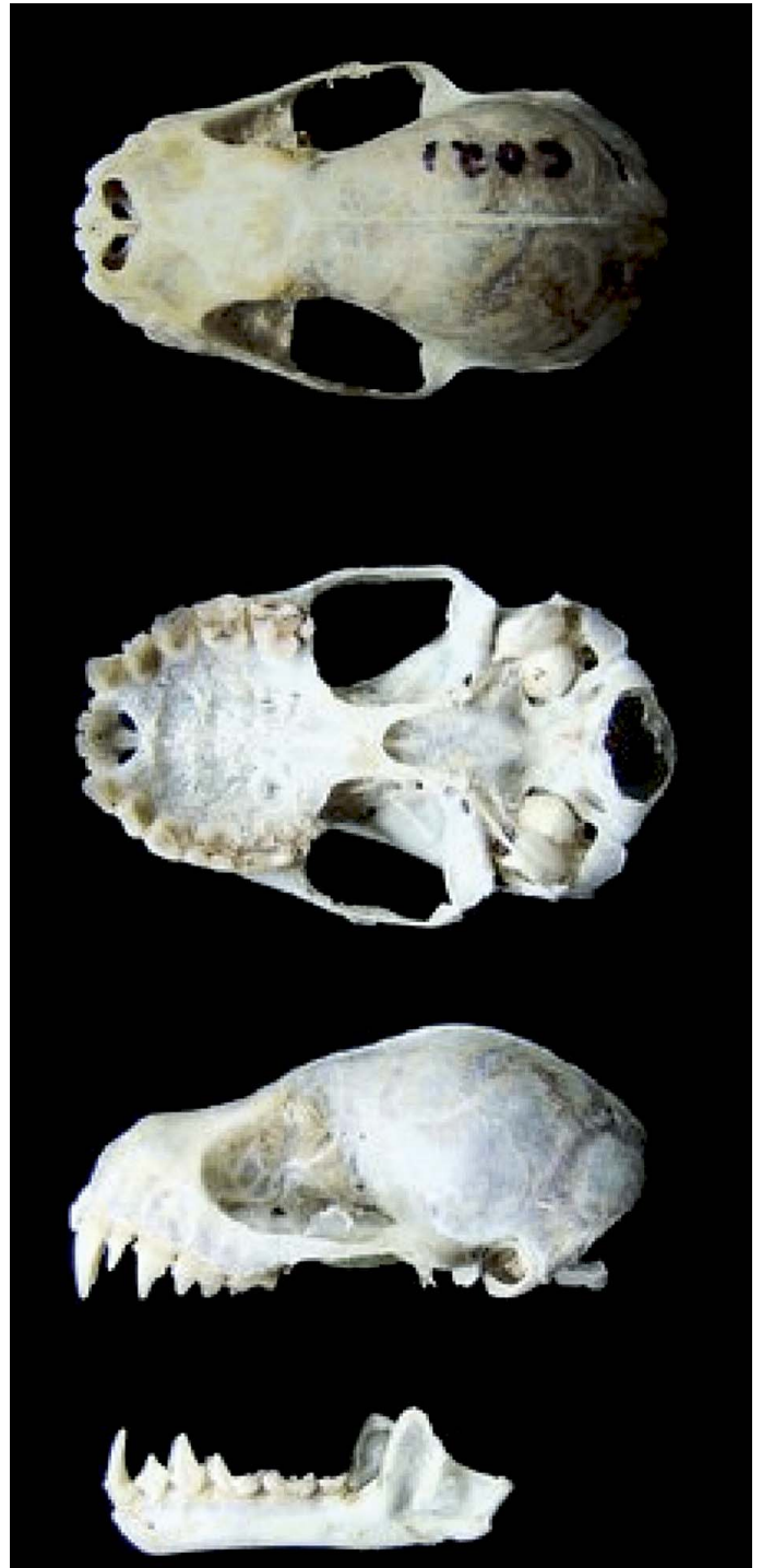
Fig. 2. —Dorsal, ventral, and lateral view of skull and lateral view of mandible of an adult male Platyrrhinus recifinus from Brazil, Minas Gerais, Município de Coqueiral (Coleção de Mastozologia da Universidade Federal de Lavras [CMUFLA] 113). Greatest length of skull is 23.92 mm.

Dorsal color of Platyrrhinus recifinus is dark brown to grayish, and the venter is generally paler than the dorsum. The dorsal fur is from 6.3 to 7.5 mm long and has 4 color bands; ventral fur has 3 color bands. The bat has conspicuous white dorsomedial and ventrolateral facial stripes; the white dorsal stripe is wide and conspicuous. The genal vibrissae are implanted in a basal, wart-like protuberance. There are 7 vibrissae surrounding the margin of the nose leaf in a single array, a single vibrissa is present on the upper lip ventral to the vibrissae that surround the margin of the nose leaf, and 4 submental vibrissae lie on each side of the chin. The inferior border of the horseshoe is free from the upper lip. Parallel folds in the pinna are poorly marked but are distinguishable. The posterior edge of the plagiopatagium inserts at the level of the 1st metatarsal; long, dense hair covers the upper surfaces of the feet. The posterior border of the uropatagium is U shaped and densely haired. The posterior border of the hard palate is U shaped; the postorbital and paraoccipital processes are moderately developed (Fig. 2). A shallow fossa may occur in the squamosal end of the zygomatic arch, lateral to the glenoid fossa. The upper outer incisors are unicuspidate; there is a