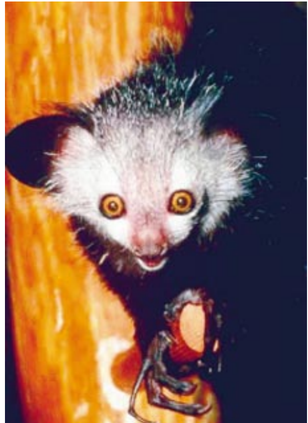
FIG. 1. Daubentonia madagascariensis .

DISTRIBUTION. Distribution of D. madagascariensis is wide in Madagascar (Fig. 3), but population density remains low in all areas. Range extends in the north to Montagne d’Ambre and Sambava, in the northwest to Sambirano, and in the south to Ran-