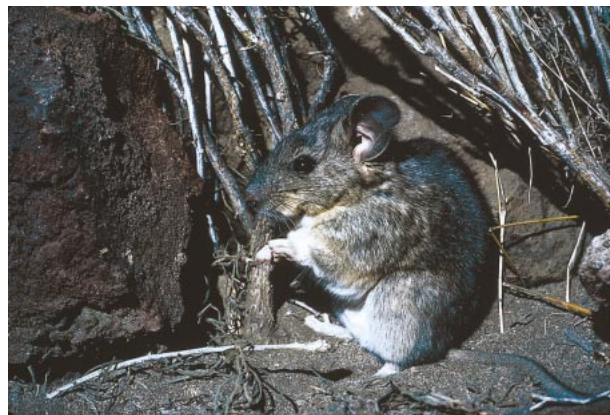
FIG. 1. Photograph of Neotoma lepida .

GENERAL CHARACTERS. Dorsal pelages among desert woodrats range from pale, buffy gray to dark gray and from cinnamon to nearly black. Depending on the color of substrate, considerable variation in pelage color may occur within an area of