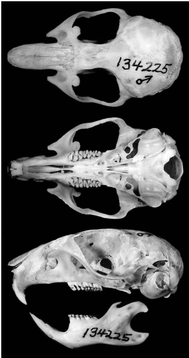
FIG. 2. Dorsal, ventral, and lateral views of the skull and labial view of the mandible of a male Reithrodon auritus from Chile Chico, Aisén, Chile (Field Museum of Natural History [FMNH] 134225). Greatest length of the skull is 33 mm.

length of tail, 96.4 (91–102, 7); and length of ear, 22.6 (15–28, 9). Measurements (in mm, n ) for specimens from Aisén, southern Chile (Kelt 1994) are: total length, 212.1 (19); length of tail, 83.89 (19); length of hindfoot, 32.13 (19); and length of ear, 23.28 (16). Body mass of trapped individuals varied from 20.5 to 116 g (Pearson 1988) and averaged 80 g ( n = 65 ) in northwestern Patagonia (Guthmann et al. 1997).