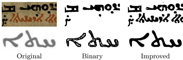
Figure 2: Problems with binarization. First row shows red text (©The British Library Board: Add. 17,256, f. 10a), second row shows high-resolution faded text (simulated example).