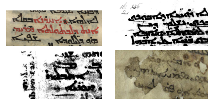
Figure 1: Samples of some documents from the collection, hinting at their diversity. Add. 12,148, f. 129a; Add. 14,490, f. 162a; Add. 17,170, f. 5a; Add. 17,213, f. 5a.

Annotators are instructed to choose bounding boxes that enclose the entire letter tightly. In most cases, this requires choosing boundaries that also include portions of other letters. Syriac writing is cursive in style, so it is common for strokes belonging to other letters to touch or connect to the letter of interest. It would be useful if the human agent could specify the exact boundary of the letter of interest, perhaps by tracing it with a mouse or through some other means. Unfortunately, this would greatly increase the time of interaction required for each sample, making the work