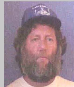
Paul Mock Days 7:00am-3:00pm McConnell 1st Floor & Basement Burton Basement, Glass Washing