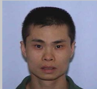
Tan Chen Evening 3:30-11:30pm 2nd Floor