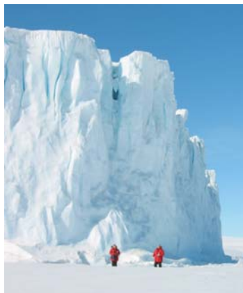
The Barne Glacier meets the McMurdo Sound Sea Ice, Antarctica