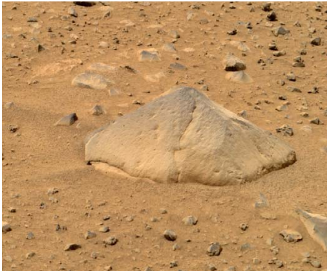
The rock known as “Adirondack” on Mars

Mars has always been known as the Red Planet. The color red in minerals is often caused by the presence of iron, so it is likely that iron-bearing minerals contribute to spectra of Mars. Satellite images have suggested the presence of minerals such as hematite ( \alpha\text{-Fe}_2\text{O}_3 ), ferrihydrite ( 5\text{Fe}_2\text{O}_3 \cdot 9\text{H}_2\text{O} ), goethite ( \alpha\text{-FeO(OH)} ), and carbonate group minerals ( \text{Ca(Fe}^{2+}, \text{Mg, Mn)(CO}_3)_2 ). For this reason, Mossbauer spectrometers, useful in the identification and interpretation of Fe-bearing minerals, were included in the instrument packages of both the NASA Mars Exploration Rovers (MERs), Spirit and Opportunity, and the lost ESA Beagle 2 lander. In this talk, I'll present a brief overview of how Mössbauer spectroscopy works, and talk about how we've been preparing for the mission through work at Mount Holyoke. I will show all the Mössbauer spectra collected to date on the martian surface, and discuss possible interpretations of them. Finally, I will discuss results on the same rocks obtained by the Mini-TES and APXS spectrometers on the rovers, and how the results of all three of these techniques can be integrated to gain an understanding of the mineralogy on the surface of Mars.