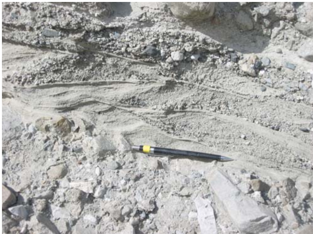
Cross bedded fluvial sands sandwiched between glacial diamicts, Oliver Bluffs, Antarctica

I was invited to join a research expedition to Antarctica this past austral summer (November and December 2003) to help interpret the stratigraphy and depositional environments of the Sirius Group deposits exposed at 85 degrees south, adjacent to the Polar Ice Cap and the Beardmore Glacier. We found an amazing variety of glacial sediments, from sub-glacial lodgement tills to water-washed outwash to finely laminated lacustrine deposits. We also recovered numerous plant fossils, including leaves of the Southern Beech ( Nothofagus ) and in-situ small plants. All of these features suggest an environment similar to today's Alaskan proglacial environments. However, we have no age control for these sediments (yet) so our work does not resolve the debate of Antarctic ice sheet stability. I will share our preliminary evidence and discuss the evidence in favor of recently dynamic Antarctic ice sheets and report our plans for helping to resolve this debate.