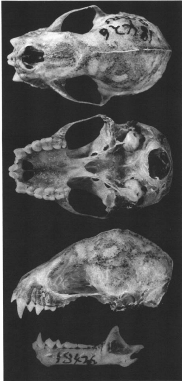
FIG. 2. Dorsal, ventral, and lateral views of cranium and lateral view of lower jaw of Sturnira lilium (Texas Tech Univ. 18426, adult female) from 2.5 km NW Dzitla, Yucatán, México. The greatest length of skull is 21.3 mm.

DISTRIBUTION. Although found in both humid and semi-arid forests, S. lilium usually selects moist parts of forests and open areas (Handley, 1976). It is widely distributed (Fig. 3), occurring from northwestern México (Sonora), southward through Central America into tropical and subtropical South America, to northern Argentina and Uruguay; it also occurs in the Lesser Antilles north to Dominica and on Trinidad. Of the six recognized subspecies, four are isolated geographically on islands of the Lesser Antilles. S. l. angeli is known only from Dominica, S. l. luciae occurs only on St. Lucia, S. l. paulsoni is found only on St. Vincent, and S. l. zygomaticus is known only from Martinique. S. l. parvidens occurs from northern México through Middle America into Colombia and western Venezuela. S. l. lilium has a broad distribution; it occurs on Trinidad and is known from all nations of South America, except Chile (Koopman, 1982).