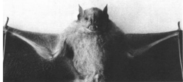
FIG. 1. Photograph of adult Sturnira lilium from Exu, Pernambuco, Brazil.

In specimens examined from São Paulo, Brazil (Taddei, 1975), the sample means of males were larger than those of females for 17 external characters, but statistically significant variation was not detected; for cranial characters, males were significantly larger than females in 15 of 17 characters. Willig (1983) found one external character (total length) to exhibit statistically significant sexual variation in specimens from northeastern Brazil. For cranial measurements, both univariate (Willig, 1983) and multivariate (Willig et al., 1986) analyses indicated statistically significant secondary sexual variation, with males larger than females.