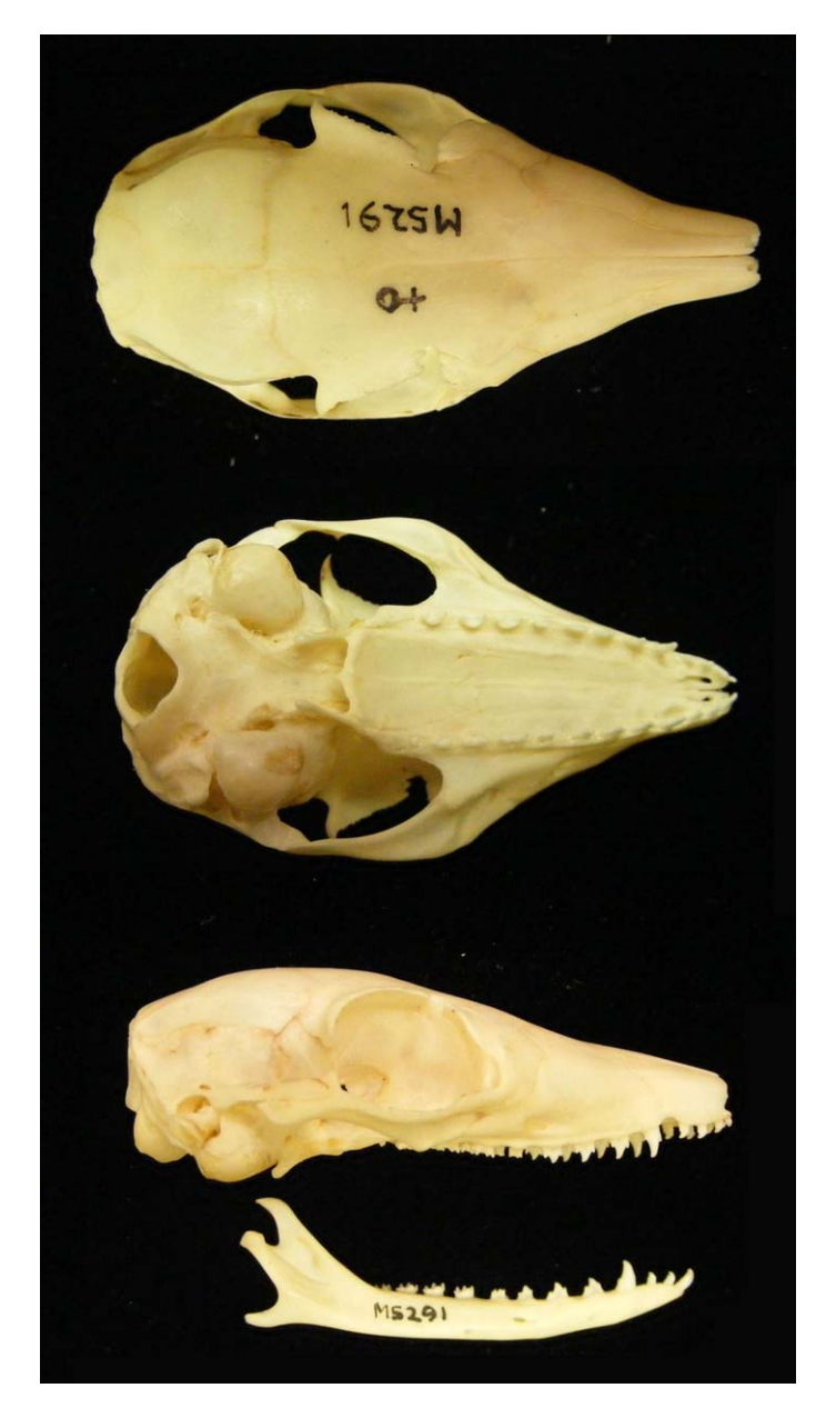
Fig. 2. —Dorsal, ventral, and lateral views of skull and lateral view of mandible of a female Myrmecobius fasciatus (M5291) from Pingelly, Western Australia (32°32′00″S 117°05′00″E). Greatest length of skull is 60.6 mm. Specimen courtesy of the Western Australian Museum; photographs by C. E. Cooper.

extending well outside the orbit (Fig. 2). The paroccipital processes are completely fused behind the mastoids and the palatal branches of the premaxilla remain separate at the front of the palate (Tate 1951). The teeth are numerous, greatly reduced in size, and modified in form. The dentition is variable between individuals of M. fasciatus , and even between the 2 sides of the jaw for the same individual, but can be generalized with the following dental formula: i 4/3, c 1/1, p 3/3, dpm 1/1, m 4/4, total 50 (Friend 1993). There are always more than 7 postcanine teeth in the lower jaw; this is