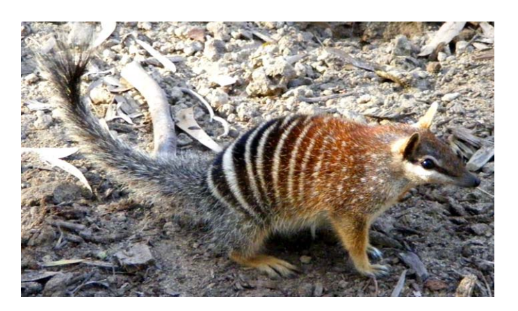
Fig. 1. —Adult male Myrmecobius fasciatus .  of a specimen at Perth Zoo.

NOMENCLATURAL NOTES. The vernacular name numbat is derived from Australian Aboriginal terms for M. fasciatus including noobat, nombat, nyoombot, and nambart. Terms wai-hoo, wai-hao, weeoo, weeou, wee-u, weeu, wi-u, wiu, walpurti, mutjurarranypa, and parrtjilaranypa also have been used by Aboriginal people to describe this species (Abbott 2001; Friend 2008). Early European vernacular names included banded anteater, marsupial anteater, and white-banded bandicoot; numbat is the currently accepted common name (Friend 2008; Strahan and Conder 2007; Troughton 1967; Wood Jones 1923b). M. f. rufus was commonly known as the southeastern or rusty numbat (Friend et al. 1982; Troughton 1967).