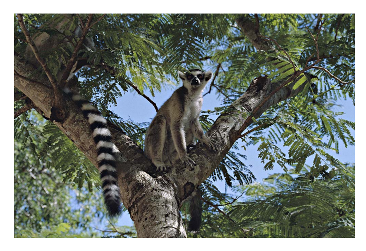
Fig. 1.—An adult Lemur catta in the Berenty Nature Reserve, Madagascar.

The earliest mention in the literature of what is clearly L. catta is a brief description by Samuel Purchas (1625), who compared them to monkeys in size, but with a long tail like a fox, ringed with black and white. Lemur is from the Latin