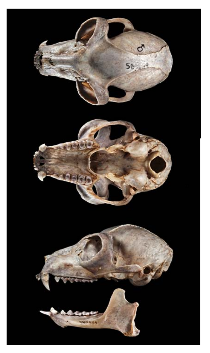
Fig. 2. —Dorsal, ventral, and lateral views of the skull and lateral view of the lower mandible of Lemur catta (adult male, United States National Museum no. 589559), collector and locality unknown.

The body of L. catta is covered with dense, gray to gray-brown pelage, slightly darker around head and neck, with the exception of the ventral side and face. The underside, throat, and face are lightly haired with a paler, off-white color that allows darker skin to show beneath. The eyes are accentuated by conspicuous black, triangular rings around them, contrasting sharply with the white interocular area (Garbutt 1999; Jolly 1966; Mittermeier et al. 2006; Tattersall 1982). The ears are large and well furred, but without tufts. There is no obvious body color difference between males and females but variation may exist between individuals in the facial region (Jolly 1966). Dorsally, they are warm rosy brown grading into pale gray or grayish brown on the rump,