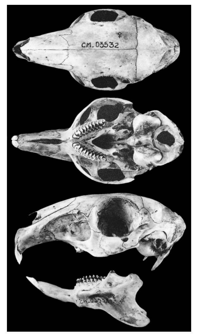
FIG. 2. Dorsal, ventral, and lateral views of cranium and lateral view of mandible of an adult female mara Dolichotis pata gonum (Colección IADIZA Mastozoología, CIM 03532). Greatest length of cranium is 128 mm.

in the wild, most females produce only 1 litter each year (Taber 1987). Average litter size is 2 (range, 1–3). Young can walk almost immediately postpartum.