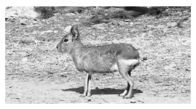
FIG. 1. Adult Dolichotis patagonum from the Mendoza Zoo, Mendoza Province, Argentina, 1997. Photograph by M. F. Tognelli.

ONTOGENY AND REPRODUCTION. Breeding in southern Argentina is from August to January, and groups of 1–29 pairs gather at single dens (Taber and Macdonald 1992a). In Patagonia, births are highly seasonal, and most occur between September and October, before the summer dry season and after the fall and winter rains (Taber 1987). Pairs reproduce year round. In captivity, maras produce 3 or 4 litters each year (Dubost and Genest 1974), whereas