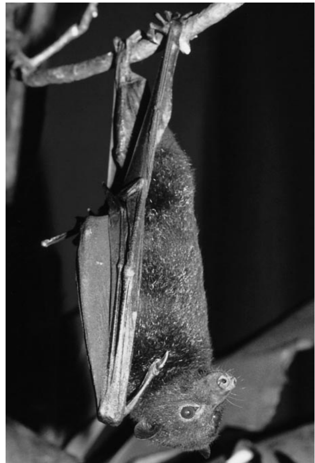
FIG. 1. Female Pteropus hypomelanus from Indonesia, housed in captivity at The Lube Foundation, Inc., Gainesville, Florida.

dorsal tibia (Klingener and Creighton, 1984) also delineates members of the hypomelanus group. Within this group, P. hypomelanus is distinguished from P. faunulus by its larger body size, larger teeth, and shorter fur (Andersen, 1912; Corbet and Hill, 1992). P. griseus has a shorter length of forearm (<118 mm), a shorter c-m_2 length (<19.8 mm), and paler pelage than P. hypomelanus (Andersen, 1912). P. dasymallus has a length of forearm (125–140 mm) similar to that of P. hypomelanus (121–150 mm), but a shorter greatest length of skull (59.0–62.5 mm) than P. hypomelanus (62.1–69.0 mm); P. dasymallus also has longer and denser pelage than P. hypomelanus , and unlike P. hypomelanus , has fur on the upper surface of its hind limbs (Ingle and Heaney, 1992). P. hypomelanus is smaller than P. alecto , P. conspicillatus , P. macrootis , and P. neohibernicus (Flannery, 1990). Length of forearm of P. hypomelanus (<150 mm) and condylobasal length (<65 mm) distinguish it from P. vampyrus (length of forearm >165 mm and condylobasal length >68 mm). A pale patch of fur on the chest distinguishes P. hypomelanus from the gold-colored form of P. vampyrus (Ingle and Heaney, 1992; Payne et al., 1985). P. hypomelanus is larger than P. pumilus (with a length of forearm <113 mm and a condylobasal length <52 mm), and hairs on the throat of P. hypomelanus are dark brown instead of pale gray as in P.