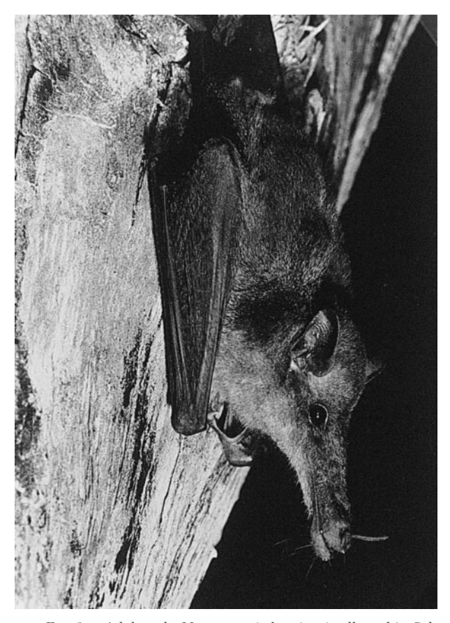
FIG. 1. Adult male Musonycteris harrisoni collected in Callejones, ca. 12 km NE from Cerro de Ortega, Colima, Mexico.

FORM AND FUNCTION. The aspect ratio, 6.3, is one of the highest among members of the subfamily. The wing morphology is as follows: alpha angle, 33.22; tip index, 1.9; aspect ratio of the wing tip, 5.13; aspect ratio of the plagiopatagium, 1.55; and wing loading, 15.58 N/m<sup>2</sup>. In relative terms, the dimensions of the wing are as follows: length of the wing, 1.75; length of the forearm, 0.59; length of digit III, 1.16; length of digit IV, 0.82; and length of digit