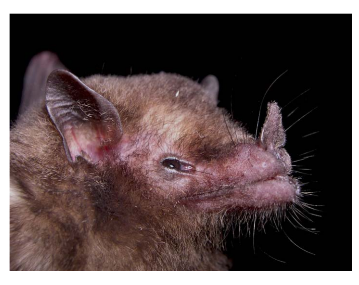
Fig. 1. —An adult Anoura caudifer from Parque Estadual Intervales, São Paulo, Brazil.