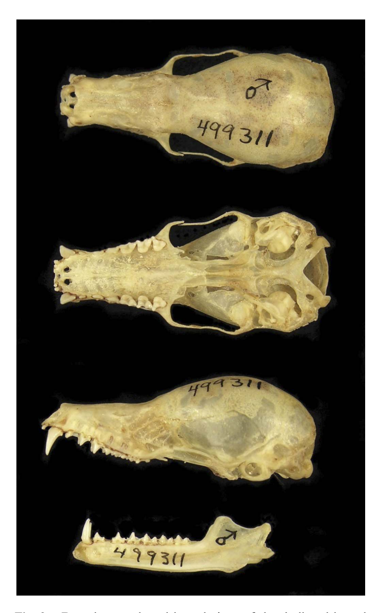
Fig. 2. —Dorsal, ventral, and lateral views of the skull and lateral view of mandible of an adult male Anoura caudifer (USNM [United States National Museum] 49931) from Zaragoza 25 km S, 22 km W, at La Tirana, Colombia.

foot, 9.25, 7.0–12.0 (9.2, 8.0–11.0); length of tail, 4.9, 3.5–7.0 (5.5, 4.0–10.0). Means and ranges (mm) for the same males and females (in parentheses) cited above for length of skull were: 21.8, 20.8–23.8 (21.6, 20.8–22.1).