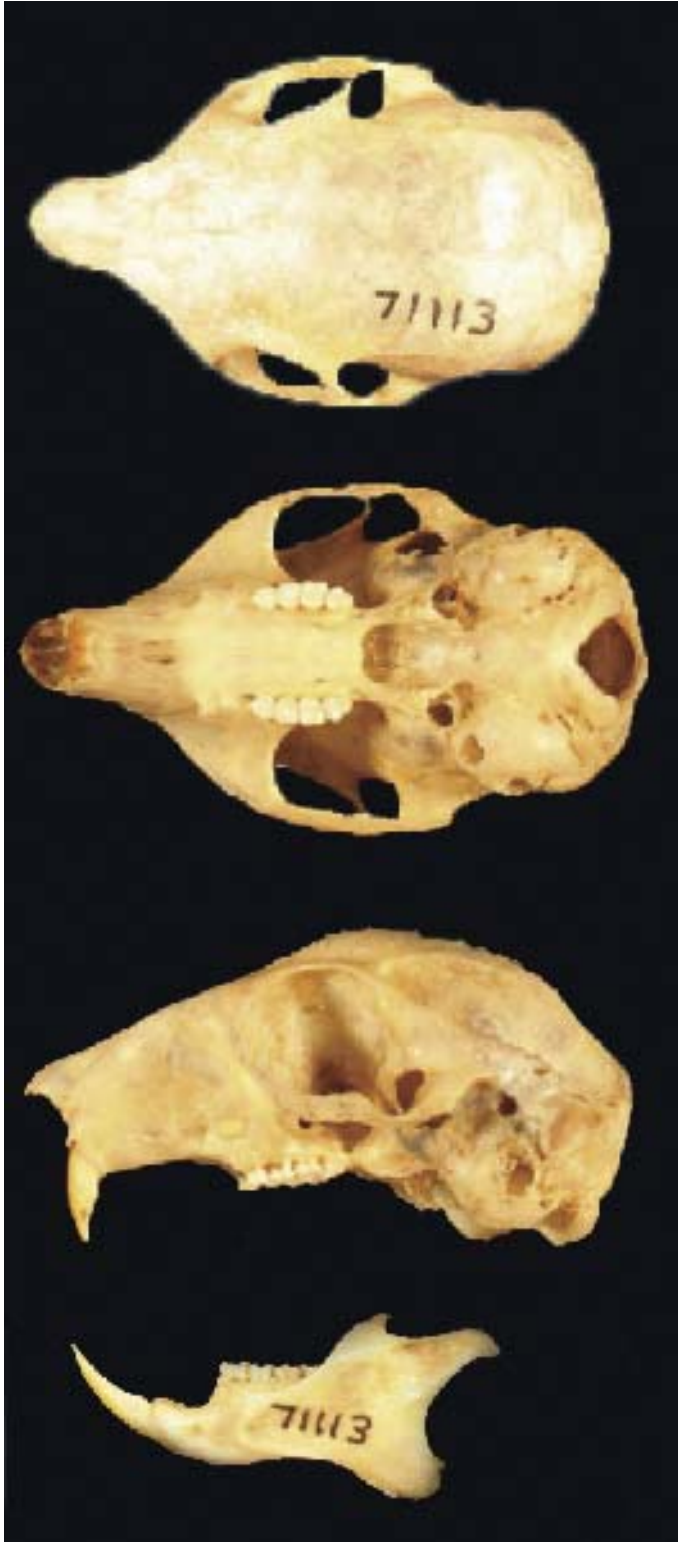
Fig. 2.—Dorsal, ventral, and lateral views of skull and lateral view of mandible of Sciurus pucheranii (female from Huila, Colombia; The Field Museum, Chicago, Illinois; specimen 71113). Greatest length of skull is 42.6 mm.

NOMENCLATURAL NOTES. The English and Spanish common names for Sciurus pucheranii are Andean squirrel (Wilson and Cole 2000) and ardillita de los robledales (Rodríguez-Mahecha et al. 1995), respectively. Pucheran 1st described S. pucheranii as S. rufoniger in 1842. This name was already in use and was changed to pucheranii by Fitzinger in 1867 (Allen 1915). As many as 4 subspecies of S. pucheranii have been recognized in the past: S. p. caucensis , S. p. medellinensis , S. p. pucheranii , and S. p. santanderensis (Allen 1915; Anthony 1923; Borrero-H. 1967; Ellerman 1940; Hernández-Camacho 1957). Microsciurus santandarensis was originally included as a subspecies of S. pucheranii but is now recognized as a separate species (Borrero-H. and Hernández-Camacho 1957; Hernández-Camacho 1960). S. pucheranii has been referred to as S. aestuans caucensis (Allen 1912) and S. pucherani in other publications (Alberico et al. 2000; Didier 1955; Ellerman 1940; Honacki et al. 1982).