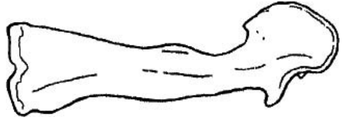
Fig. 4.—Lateral view of a baculum of Sciurus pucheranii from Acevedo, Huila, Colombia (drawing modified from Didier [1955]).

Sciurus pucheranii has 6 paired mammae (Allen 1915; Hernández-Camacho 1957). The baculum of S. pucheranii is