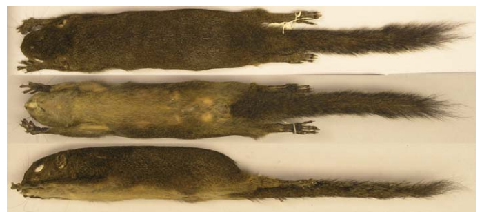
Fig. 1. —Dorsal, ventral, and lateral views of prepared specimen of Sciurus pucheranii (female from Puerto Asis, Colombia; Museum of Vertebrate Zoology, Berkeley Natural History Museum; specimen 124045).

S. p. pucheranii (Fitzinger, 1867). See above.