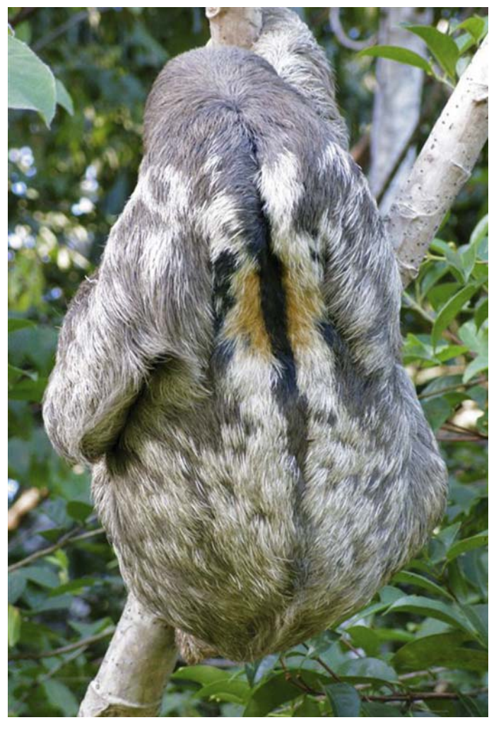
Fig. 1. —Adult male Bradypus tridactylus from Suriname showing the sex-specific dorsal speculum.

Arctopithecus cuculliger: Gray, 1871:440. Name combination.