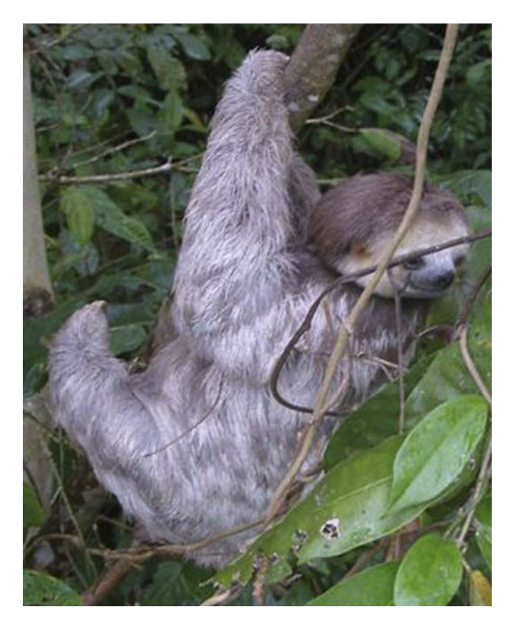
Fig. 4. —Adult female in typical arboreal habitat in Suriname showing the ability to turn the head 180°.

Bradypus tridactylus is vulnerable to cats (jaguar [Panthera onca] and margay [Leopardus wiedii]), snakes (anaconda [Eunectes]), and harpy eagles (Harpia harpyja—Beebe 1926; Hoke 1987; Izor 1985). B. tridactylus is difficult to keep in captivity except where the animal is endemic (Hoke 1987). They succumb to viral infections and trace element deficiencies (Hoke 1987). Electroejaculation has been successful (Peres et al. 2008).