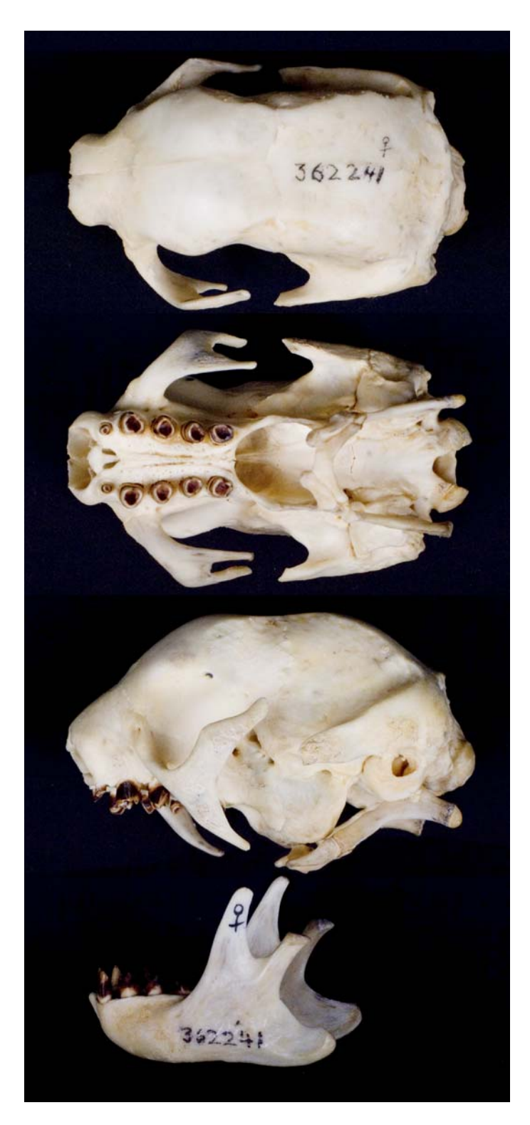
Fig. 2. —Dorsal, ventral, and lateral views of skull (with atlas attached) and lateral view of mandible of an adult female Bradypus tridactylus (United States National Museum 362241) from the upper Takutu River region of Guyana. Greatest length of skull is 69.96 mm.