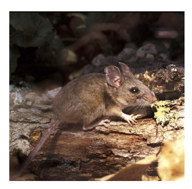
Fig. 1. —An adult male Peromyscus boylii rowleyi from lower Robertson Creek at the Hastings Natural History Reserve, Monterey County, California (22.5 km southeast of Carmel Valley, 36°22′N, 121°22′W). Photograph by Matina C. Kalcounis-Rueppell, 27 July 2002.

CONTEXT AND CONTENT. Order Rodentia, suborder Myomorpha, superfamily Muroidea, family Cricetidae, subfamily Neotominae, tribe Reithrodontomyini, subgenus Peromyscus ; boylii species group (Musser and Carleton 2005). The genus Peromyscus includes 56 nominal species (Musser