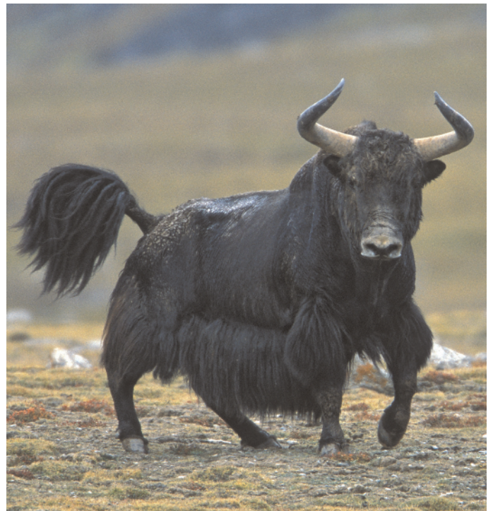
Fig. 1. —Mature male wild yak ( Bos mutus ) in Yeniugou, central Qinghai, China.

Gauribos Heude, 1901:3. No type species selected; said to include G. laosiensis , G. brachyrhinus , G. sylvanus , and G. mekongensis .