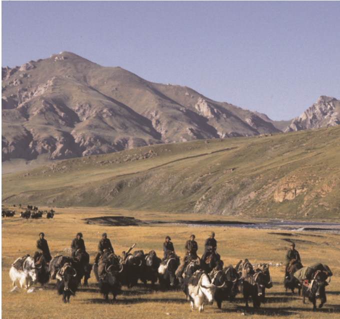
Fig. 6. —Nomadic pastoralists were dependent on domestic yaks ( Bos grunniens ) to move supplies throughout the Tibetan Plateau; trucks now deliver most supplies.

Because of the harsh environmental conditions in the Tibetan Plateau, the genesis and persistence of nomadic pastoralism likely involved an early domesticated form of the wild yak (Buchholtz and Sambraus 1990; Goldstein and Beall 1990). Although the specifics of the domestication of the yak are obscure (Rhode et al. 2007), it is thought to have occurred during at least 2 separate events (Bailey et al. 2002) in the northern part of Tibet (Flad et al. 2007). The 2,500-year-old Ordos Bronzes of the horned heads and bodies of domestic yaks that form buckles and plaques from Tibet through southern Russia attest to the species' cultural importance after domestication (Olsen 1986).