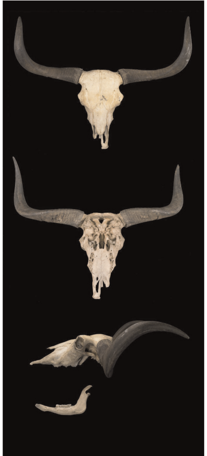
Fig. 4. —Dorsal, ventral, and lateral views of skull and lateral view of mandible of an adult male domestic yak ( Bos grunniens ); zoo specimen of unknown origin (National Museum of Natural History, specimen 174734). Greatest length of skull 525 mm.

The alimentary organs of the yak have evolved to deal with the limited forage availability and quality in its native range (Wiener et al. 2003). The mouth is broad, muzzle small, and lips flexible. Incisors have flat grinding surfaces,