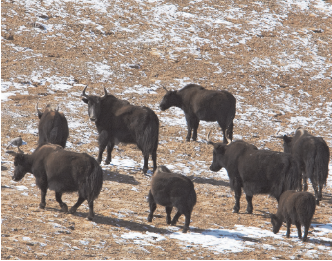
Fig. 5. —Wild yak ( Bos mutus ) adult females and calves in Yeniugou, central Qinghai, China.

males advancing to reconnoiter” (Przewalski 1876:190; Rawling 1905; Schaller 1998).