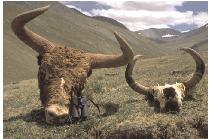
Fig. 3. —Skulls of male (left) and female (right) wild yaks ( Bos mutus ) from Yeniugou, central Qinghai, China, highlighting relative mass and sexual dimorphism in skull size and horn shape.

Relative to mass, a small female wild yak may be only one-third the size of a large male; in contrast, female domestic yaks are 25–50% smaller (Harris 2008; Miller et al. 1994; Wiener et al. 2003). Body mass (kg) of adult male wild yaks has been estimated at >800 kg (Engelmann 1938) and as high as 1,000 kg (Schäfer 1937; Wiener et al. 2003:43) and 1,200 kg (Lu 2000; Lu and Li 1994); females are about