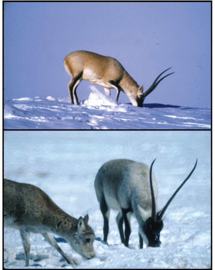
Fig. 5. —Adult male Pantholops hodgsonii pawing for scant forage (top), and adult male and female foraging in snow (bottom), Qinghai, late October.

Diets. — Pantholops hodgsonii is an herbivorous ruminant. Foraging preferences are understood mainly from limited microhistological analyses of feces (Cao et al. 2008; Harris and Miller 1995; Schaller 1998). P. hodgsonii is a mixed feeder (Cao et al. 2008), seasonally eating grasses, sedges, forbs, and select parts of dwarf woody vegetation, although dietary diversity is constrained substantially by limited forage availability and diversity on the Tibetan Plateau (Schaller 1998). In Chang Tang Nature Reserve, annual percent use of various plants is graminoids: Stipa , 3.7–47.3%; Kobresia , 1.1–33.1%; Carex moorcroftii , 0.5–22.8%; herbaceous plants: Potentilla bifurca , 0.3–31.1%, Leontopodium , 0.2–11.9%; and dwarf shrubs: Ceratoides compacta , 0.2–63.5%, Ajania fruticososa , 21.2% (Schaller 1998).