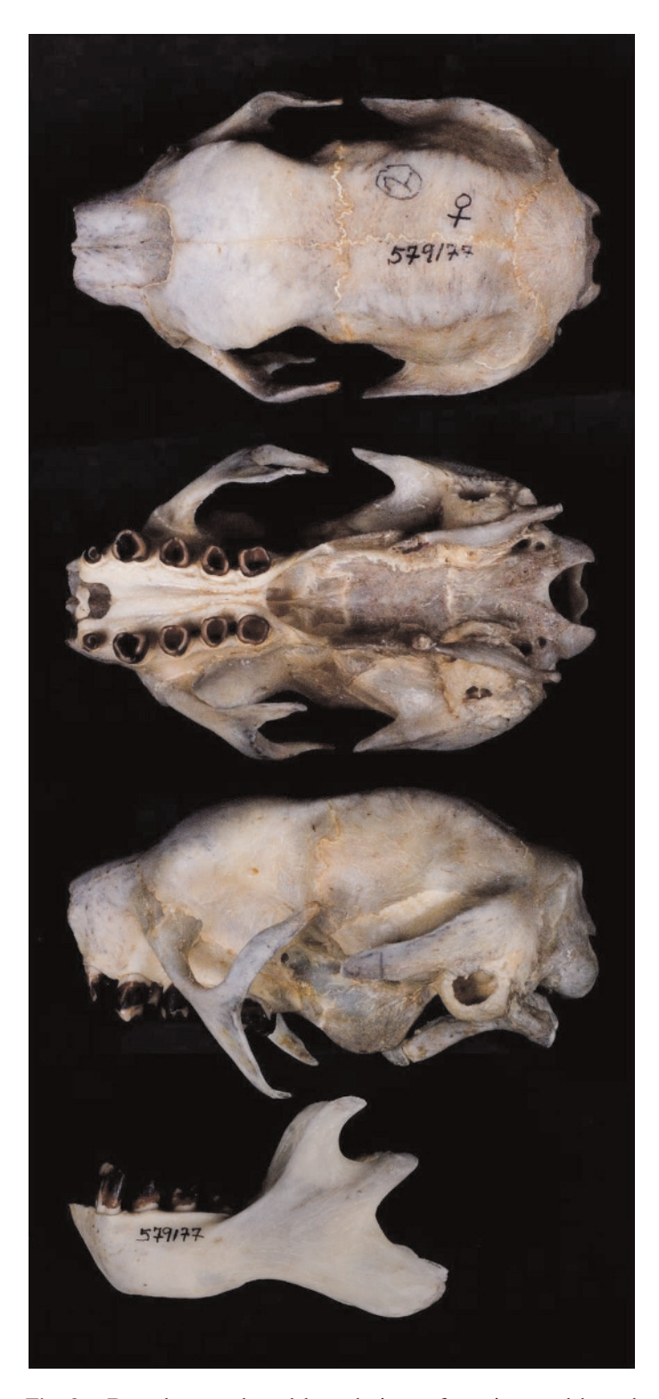
Fig. 2. —Dorsal, ventral, and lateral views of cranium and lateral view of mandible of an adult female Bradypus pygmaeus (United States National Museum 579177; age class 2 of Anderson and Handley [2001]). Greatest length of cranium is 68.7 mm.