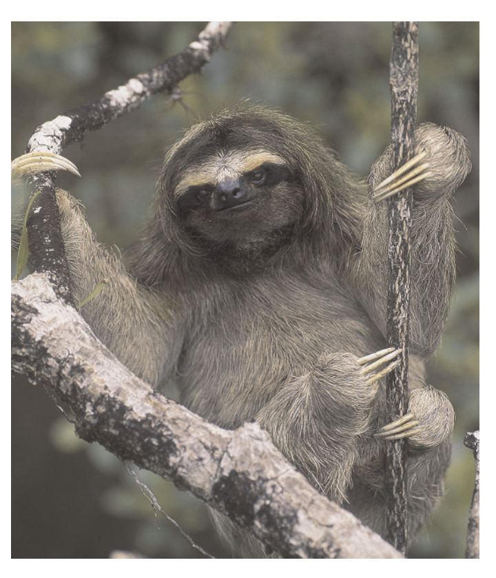
Fig. 1. —An adult Bradypus pygmaeus from Isla Escudo de Veraguas.

as extant two-toed sloths ( Choloepus ) based on craniodental characters (Gaudin 2004). This generic synonymy is modified from Gardner (2007). The following key to the 4 species of Bradypus is from Wetzel (1985) with modifications from Anderson and Handley (2001):