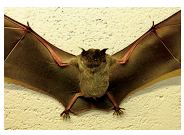
Fig. 1. Adult Phyllostomus discolor from a captive colony, Bronx Zoo, New York.

Mean external and cranial measurements combined from 8 females and 15 females (in mm, parenthetical range, n) of P. d. discolor from northwestern Venezuela (Valdez 1970) are: length of forearm, 62.0 (58.5–65.7, 23); length of skull, 30.4 (29.3–31.1, 22); condylobasal length, 27.1 (26.5–27.9, 22); zygomatic breadth, 15.8 (15.0–16.2, 20); length of maxillary toothrow, 9.8 (9.4–10.2, 13);