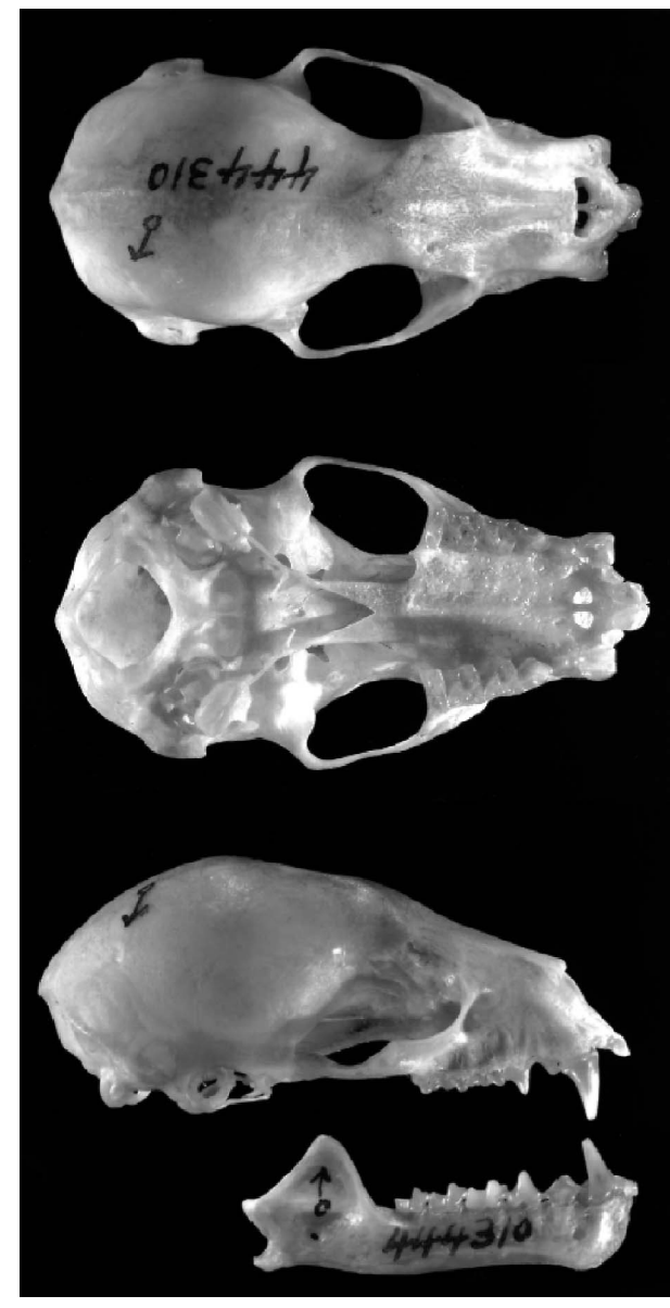
Fig. 2. Dorsal, ventral, and lateral views of cranium and lateral view of mandible of an adult male Phyllostomus discolor (United States National Museum 444310). Greatest length of skull is 29.7 mm.

breadth across molars, 10.1 (9.7–10.5, 23); breadth across canines, 7.3 (6.7–7.6, 23); and length of dentary, 19.0 (18.4–19.8, 23).