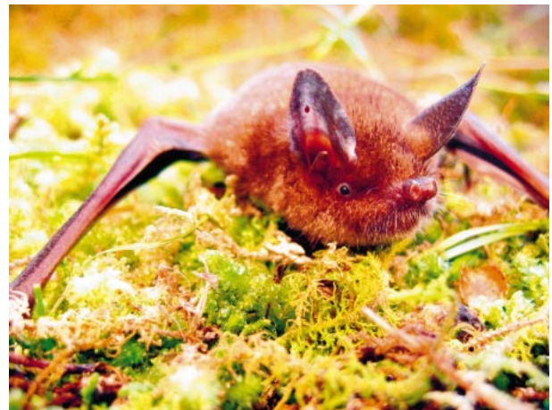
FIG. 1. Adult female Mystacina tuberculata tuberculata from the Eglinton Valley of Fiordland, New Zealand.

Morphometrics of M. tuberculata vary across subspecies and populations. Forearm measurements (mean, SD , and parenthetical range, in mm, sexes combined) are as follows: M. t. aoupourica ( n = 49 ): 40.90, 0.89 (36.95–42.00); M. t. rhyacobia ( n = 999 ): 43.64, 1.24 (39.88–46.90); M. t. tuberculata ( n = 304 ): 42.23, 1.01 (39.44–45.10—Lloyd 2001). Specimens of M. tuberculata from the Eglinton Valley of Fiordland had significantly greater