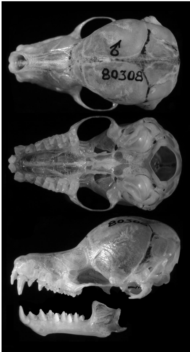
FIG. 2. Dorsal, ventral, and lateral views of cranium and lateral view of mandible of an adult male Mystacina tuberculata aoupourica collected at Omahuta Kauri Forest, New Zealand (Royal Ontario Museum specimen ROM80308). Greatest length of skull is 20.3 mm.

weights, larger forearms, and smaller ears, than those from Codfish Island and Little Barrier Island (O'Donnell et al. 1999). M. tuberculata in the Eglinton Valley is sexually dimorphic with respect to mass and forearm length, with females being significantly heavier and having longer forearms (O'Donnell et al. 1999). M. tuberculata on Little Barrier Island showed no difference in forearm length between males and females, although females were significantly heavier than males (Arkins 1996; Winnington 1999). M. tuberculata in Eglinton Valley also showed greater variation in size between age classes than did M. tuberculata on Codfish and Little Barrier Islands (O'Donnell et al. 1999).