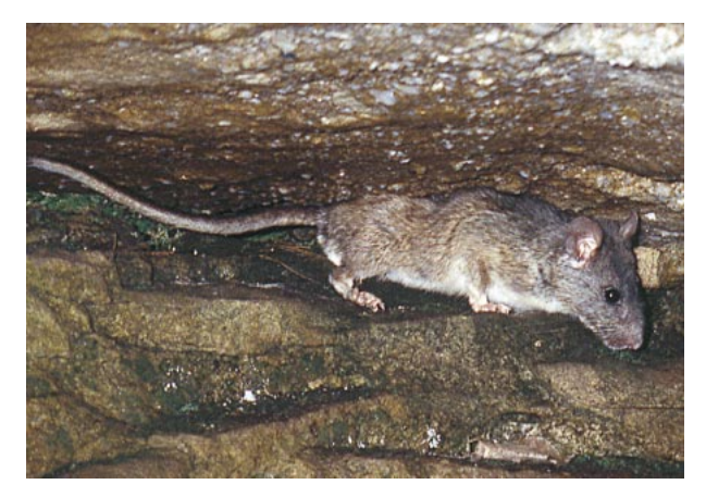
FIG. 1. Adult Neotoma magister in Randolph County, West Virginia.

FORM AND FUNCTION. Neotoma magister has long vibrissae, usually >51 mm (Ray 2000). Vibrissae number up to 50