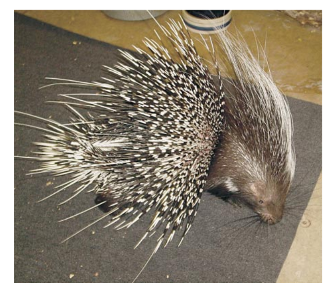
FIG. 1. Photograph of a 9-month-old male Cape porcupine ( Hystrix africaeaustralis ) at Peoria's Glen Oak Zoo, Peoria, Illinois.

GENERAL CHARACTERS. Adult H. africaeaustralis range from 10.0 to 24.1 kg and are not sexually dimorphic (Smith-