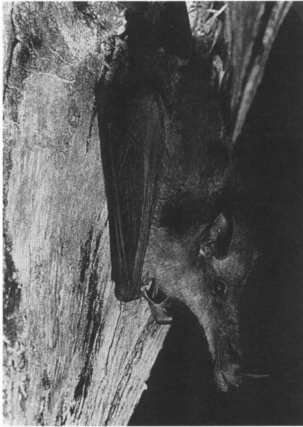
FIG. 2. Dorsal, ventral and lateral views of cranium and lateral view of mandible of Musonycteris harrisoni (UNAM 24807, adult female, from 1 km from Playa Revolcadero, Acapulco, Guerrero). Greatest length of skull is 30.04 mm.

V, 0.76. Digits III, IV, and V are made up of metacarpals and phalanges in the following proportions: digit III—metacarpal, 47.12%, first phalanx, 17.47%, second phalanx, 23.11%, and third phalanx, 12.31%; digit IV—metacarpal, 60.43%, first phalanx, 16.88%, and second phalanx, 22.70%; and digit V—metacarpal, 61.87%; first phalanx, 15.77%, and second phalanx, 22.36% (Smith and Starret, 1979).