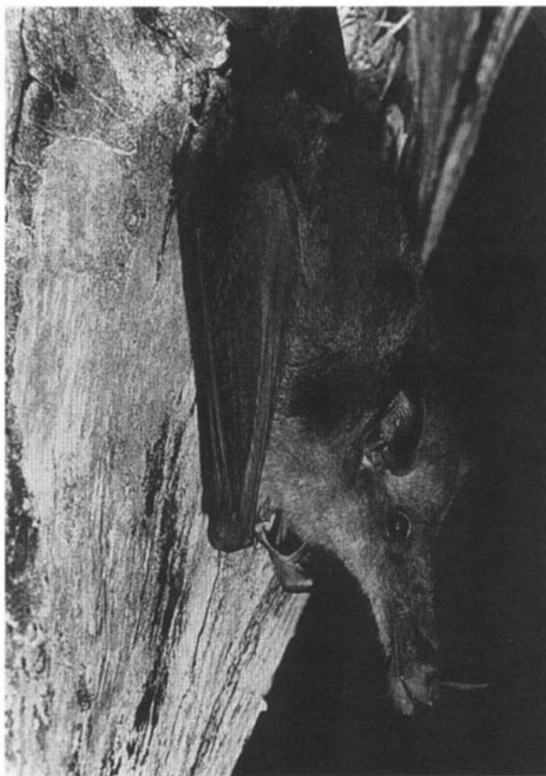
FIG. 1. Adult male Musonycteris harrisoni collected in Cal- lejonas, ca. 12 km NE from Cerro de Ortega, Colima, Mexico.

FORM AND FUNCTION. The aspect ratio, 6.3, is one of the highest among members of the subfamily. The wing morphology is as follows: alpha angle, 33.22; tip index, 1.9; aspect ratio of the wing tip, 5.13; aspect ratio of the plagiopatagium, 1.55; and wing loading, 15.58 N/m 2 . In relative terms, the dimensions of the wing are as follows: length of the wing, 1.75; length of the forearm, 0.59; length of digit III, 1.16; length of digit IV, 0.82; and length of digit