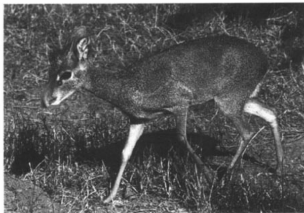
FIG. 1. Adult male Madoqua guentheri (studbook number 121; see Kumamoto, 1995) at San Diego Zoo.

GENERAL CHARACTERS. Guenther's dik-diks are of small size and slender build (Fig. 1). The hindquarters are at the same level or slightly higher than the shoulder. Typical of Neotragini, coloration is cryptic with inconspicuous markings (Estes, 1991). Dorsal pelage is generally grizzled yellowish-gray, slightly fading to grayish-brown, light rust-red, or sandy on the flanks and legs and sandy-white on the chin, throat, breast, belly, and inside