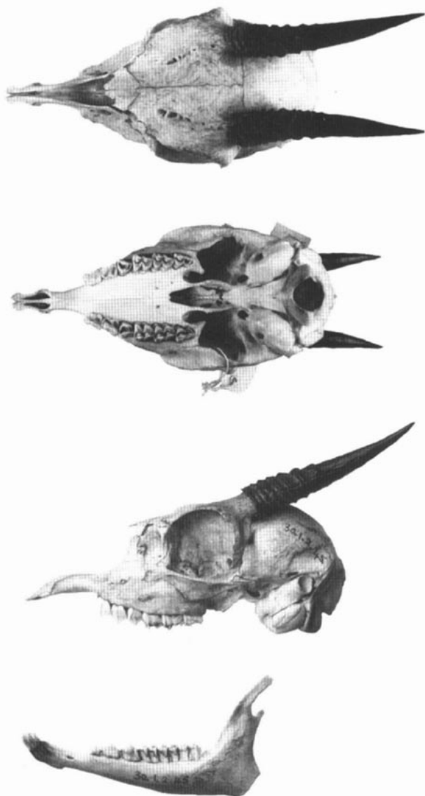
FIG. 2. Dorsal, ventral, and lateral views of skull, and lateral view of mandible of an adult male Madoqua guentheri (British Museum of Natural History 30.1.2.45) from Lake Baringo, Kenya. Greatest length of skull is 116 mm, and biorbital width is 55 mm.