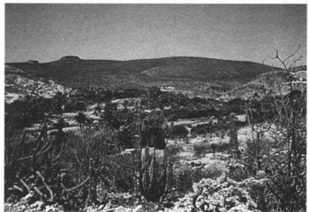
FIG. 4. Habitat of Spermophilus atricapillus .