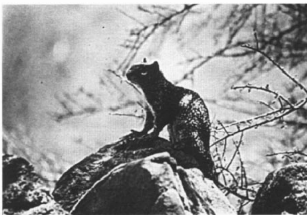
FIG 1. Spermophilus atricapillus from near San Pedro de la Presa, Baja California Sur, Mexico.

REMARKS. The specific epithet atricapillus presumably is derived from the Latin words atrium , meaning "a place blackened by smoke of the fire" and capillus , meaning "the hair of the head" (Simpson 1960:89). Bryant (1889:26) referred to the taxon as the "black-capped ground squirrel" and commented upon the "striking peculiarity of the black crown and blackish scapular region," but did not otherwise discuss the etymology. Older publications (e.g., Howell, 1938) refer to Spermophilus atricapillus as the Lower California rock squirrel. The 29 specimens from Comondú, Baja California, that formed the type collection housed in the California Academy of Science were destroyed by fire in 1906 (Howell, 1938). We thank Sergio Rosas and A. Rodríguez for taking the photographs.