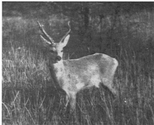
FIG. 1. Male Capreolus pygargus from Tien-Schan area.

The two subspecies of Siberian roe deer are morphologically and genetically distinct. Mean measurements from three different populations of C. p. pygargus ( n = 102 for body measurements and body mass n = 182 for skull measurements) with comparable values for five populations of C. p. tianschanicus (body measurements and body mass for 141-173 individuals per population, n = 259 for skull measurements) in parentheses are as follows: mean total length, 140-144 cm (126-137 cm); body mass, 41-48 kg (32-40 kg); condylobasal length of skull, 223-231 mm (201-218