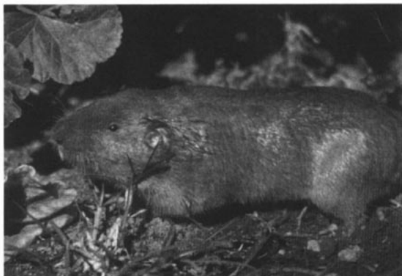
FIG. 1. An adult male tuza llanera ( Pappogeomys tylorhinus ).

FORM AND FUNCTION. The skull is strongly platycephalic (although variation exists), indicating membership in the gymnurus species-group and distinctly separating P. tylorhinus from the P. castanops species group (Fig. 3). Platycephalic specializations include a flat, broad cranium, especially expanded posteriorly to the squamosal roots of the zygomatic arches, widely spreading rami of the lower jaws and elongated angular processes, and the rugosity