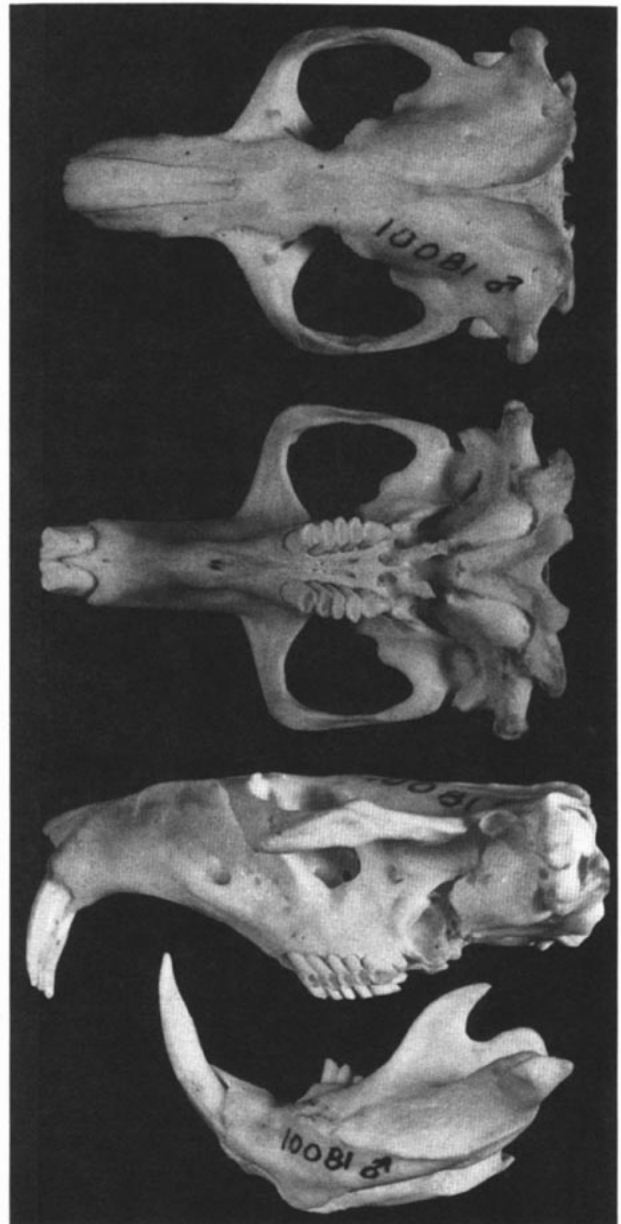
FIG. 3. Dorsal, ventral, and lateral views of cranium, and lateral and dorsal view of mandible of a male Pappogeomys tylorhinus from Pueblo Nuevo, state of México (Instituto de Biología, Universidad Nacional Autónoma de México, 10081). Greatest length of skull is 60.8 mm.

ONTOGENY AND REPRODUCTION. A pregnant female from northern Valley of México, collected in September, was