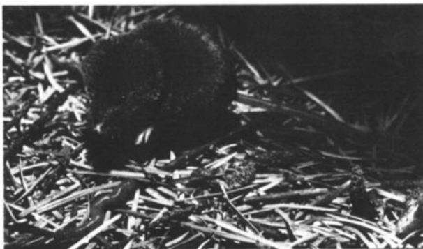
FIG. 1. Photograph of Sorex t. trowbridgii from Washington.