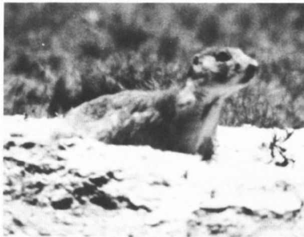
FIG. 1. Cynomys mexicanus