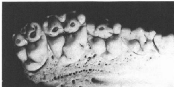
FIGURE 3. Occlusal surface of right maxillary premolars and molars of USNM 259379 demonstrating wear pattern and pattern of cusps and accessory cusplets.