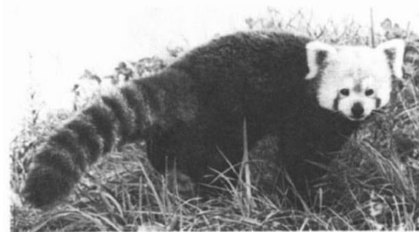
FIGURE 1. Captive male adult red panda.

FOSSIL RECORD. No fossil congeners of Ailurus fulgens are known. A variety of Old World and New World fossils intimately link Ailurus with the Procyonidae. McGrew (1938) described the similarity of the molar patterns of the early procyonid, cynarctine genera Cynarctis (Middle Miocene to Lower Pliocene of North America) and Cynarctoides (Lower Miocene of North America) with that of Ailurus . He concluded that cynarctine affinities were closer