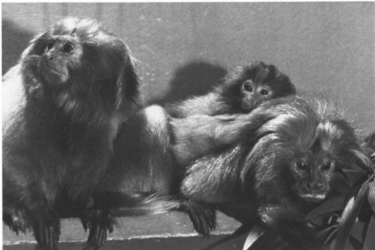
FIGURE 1. A captive golden lion tamarin family at The National Zoological Park.

FORM. Hershkovitz (1977) provided a complete summary of the morphology of L. rosalia , which forms the basis of this section unless otherwise specified. The remarkably different pattern of coloration of the three subspecies of L. rosalia has been attributed to a gradual evolutionary bleaching process (Hershkovitz, 1977). Individual differences in coloration and pattern in