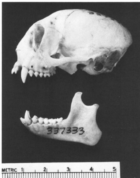
FIGURE 4. Lateral view of cranium and mandible of skull shown in Fig. 3.

The skull of L. rosalia (Figs. 3, 4) has been described by DuBrul (1965) and Hershkovitz (1977). The dental formula is i\ 2/2 , c\ 1/1 , p\ 3/3 , m\ 2/2 , total 32. The upper and lower incisors are comparatively short, and the canines are twice as long as adjacent teeth. The relationship between incisor and canine lengths has resulted in the use of the term "long-tusked" to describe Leontopithecus and Saguinus and "short-tusked" for Callithrix and Cebuella , in which the canines and long incisors are approximately the same length. Upper incisors have expanded crowns, with the outer incisor set in an oblique manner and posterior to the inner incisor (Figs. 3, 4). The lower incisors also have transversely expanded crowns, with the lateral incisor club-shaped and larger than the spatulate-shaped central incisor. The upper and lower canines are long and saberlike. Permanent upper and lower premolars are more molariform than in other callitrichids. All upper premolars are distinctly bicuspid with an incipient metacone often present in either or both P3 and P4. Lower premolars are also comparatively well molarized. Sample measurements (in