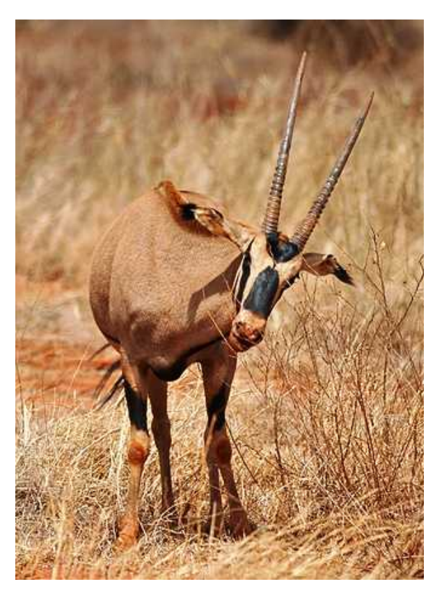
Fig. 1. —Mature male Oryx callotis south of Mount Kenya in central Kenya; note the diagnostic tufts of hair extending from the ends of the ears, pronounced horn rings, and the selective browsing.

CONTEXT AND CONTENT. Order Artiodactyla, suborder Ruminantia, infraorder Pecora, family Bovidae, subfamily Antilopinae, tribe Hippotragini. We followed the new ungulate taxonomy of Groves and Grubb (2011), who thoroughly and quantitatively updated the family Bovidae,