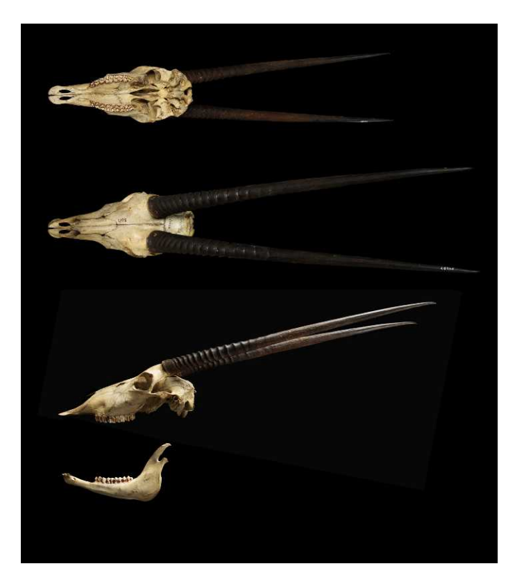
Fig. 3. —Ventral, dorsal, and lateral views of skull and lateral view of mandible of Oryx callotis (United States National Museum of Natural History, specimen 18944, sex unknown), collected by W. L. Abbott (date unknown) near Taveta in southern Kenya and the northern border of Tanzania. Greatest length of skull is 374.4 mm, average basal circumference of horns is 15.2 cm, left horn length is 70 cm, and tip-to-tip distance is 22.8 cm. The basal circumference of horns may suggest a male specimen, but the high degree of similarity of horn and skull measurements of female and male O. callotis makes it impossible to know the sex of this specimen (C. P. Groves, pers. comm.).

Galana Ranch in southeastern Kenya, daily fecal output in grams per day and percent fecal nitrogen concentrations of O. callotis were 1,378 \pm 91.2 SE and 1.22 \pm 0.051 in the dry season (April–August) and 969 \pm 67.5 and 1.57 \pm 0.022 in the wet season (January–May—Stanley Price 1985). The relatively low levels of fecal nitrogen suggested diets of only 7.6-10.2% crude protein (Leslie et al. 2008) and reflected the low-quality grasses that O. callotis generally consumed, regardless of season (Stanley Price 1985).