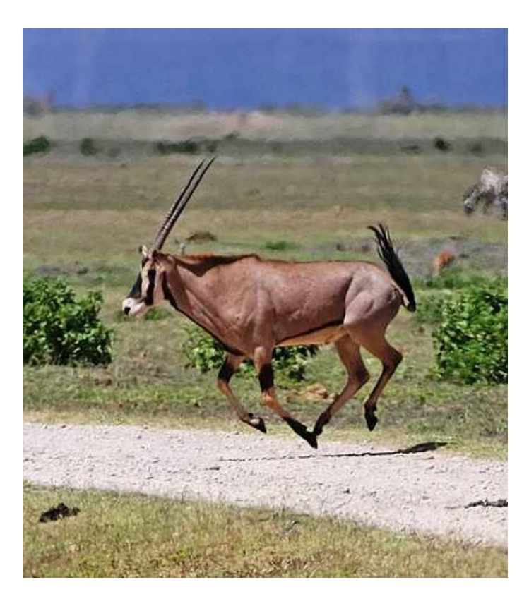
Fig. 4. — Oryx callotis galloping across an open grassland habitat in southern Kenya; such a gait is typical during circular tournament displays in which linear hierarchies are learned, tested, and reinforced (Kingdon 1997).