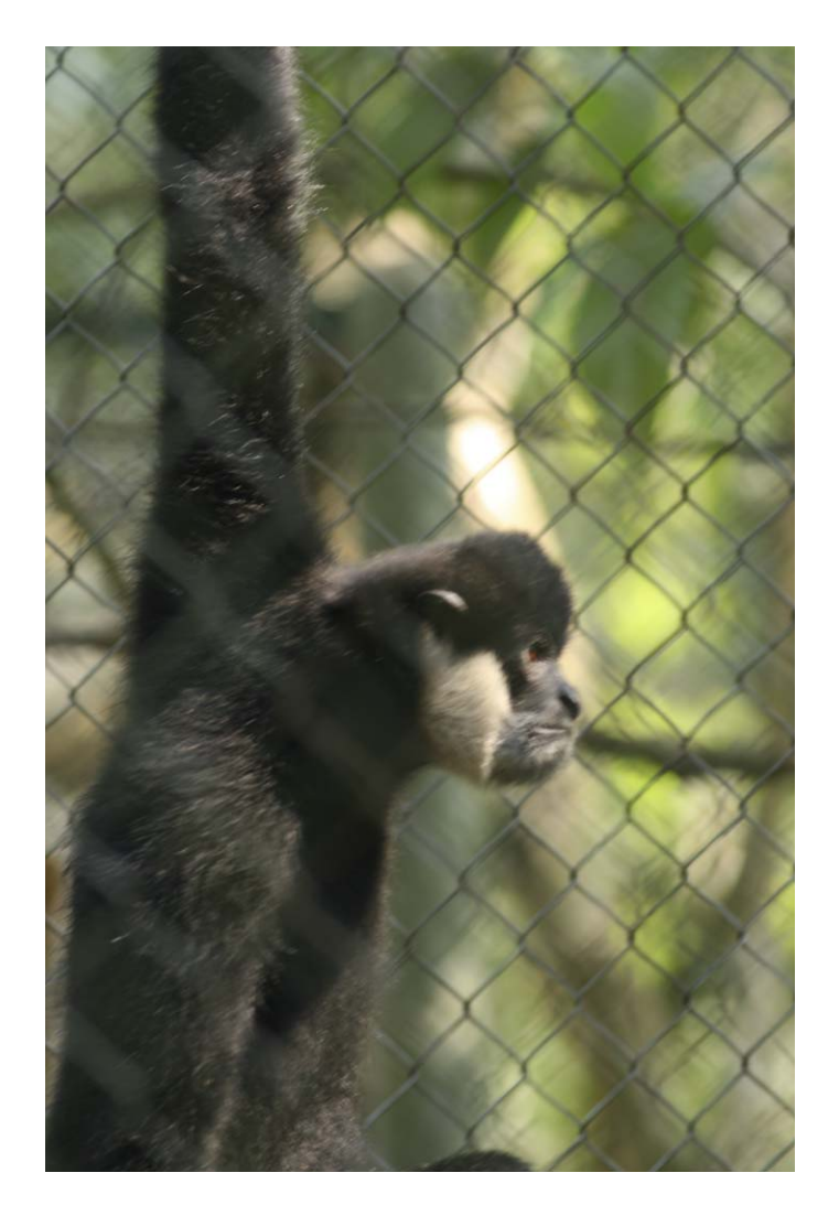
Fig. 2. —Adult male Nomascus leucogenys . This individual was confiscated from a poacher in 1999.

genital tuft as in other genera. The natal coat is light yellow or golden yellow, like the adult female, with no facial or other markings and changes to black in a few months.