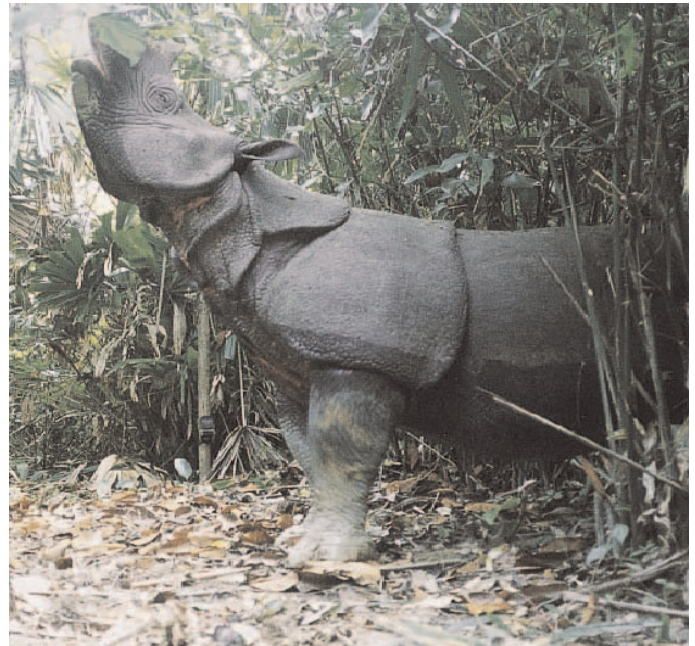
Fig. 6. —Male Rhinoceros sondaicus reaching for forage in a glade in Ujung Kulon National Park, West Java; reach of the prehensile upper lip is potentially increased by the mobility of the premaxillae in all but the most-aged adults; dermal neck folds and body shields are evident.

Tree species, particularly their saplings, and woody shrubs in second-growth forests dominate selected food items of R. sondaicus in West Java and include especially Spondias pinnata , Amomum , Leea sambucina , and Dillenia excelsa (Ammann 1985). Hoogerwerf (1970) mentions Glochidion zeylanicum , Desmodium umbellatum , Ficus septica , Pandanus , Lantana camara , and Vitex negundo —only 1 of which is in Ammann's list (at least at species level). Ammann (1985) noted that a large number of species of climbers were in the diet. R. sondaicus eats plants that have significant defenses against herbivory such as spines and thorns; Hoogerwerf (1970:105) noted that swamp thistle ( Acanthus ilicifolius ) and randu leuweung ( Gossampinus heptaphylla ) were eaten "without demur." While fruits such as those of kawung palm ( Arenga pinnata ), papaya ( Carica papaya ), and kemlandingan ( Leucaena leucocephala —Hoogerwerf 1970) have been found in feces, they do not seem to form an important part of the diet of R. sondaicus (Ammann 1985), in contrast to Indian rhinoceroses in Chitawan National Park, Nepal, which relish fruits of the ubiquitous