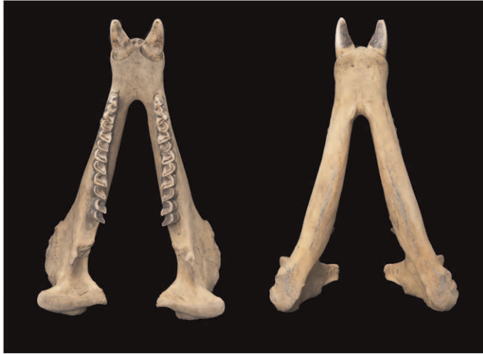
Fig. 5. —Dorsal (left) and ventral (right) views of the mandible of an adult Rhinoceros sondaicus (Natural History Museum [London] specimen 1876.3.30.1); note the large tusklike lateral incisors, characteristic of Asian rhinoceroses, and the 2 alveoli for the missing small central incisors (right mandible), characteristic of the genus Rhinoceros .

teeth of R. sondaicus “wear into ridges instead of a uniformly flat plane,” suggesting a browse diet (Lydekker 1907:35).